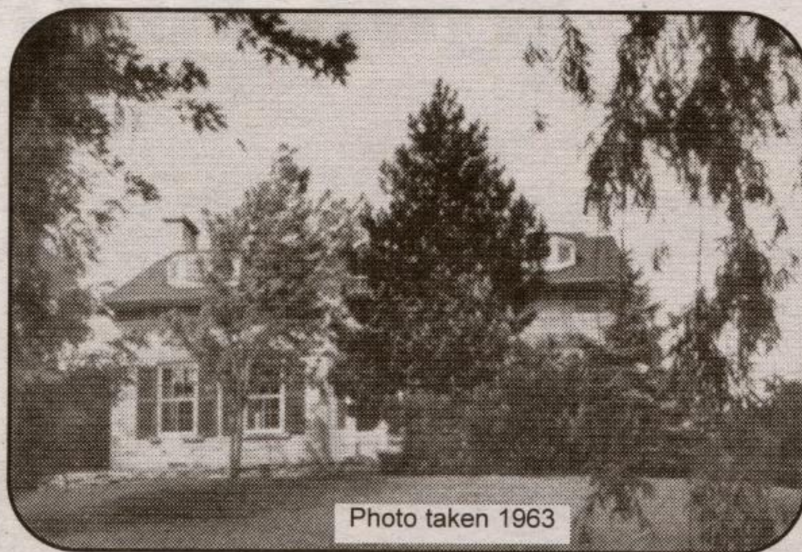
Campbell Farm, Lot 18, Conc. 2

Above: Stone farm house Below: Aerial view taken c. 1953