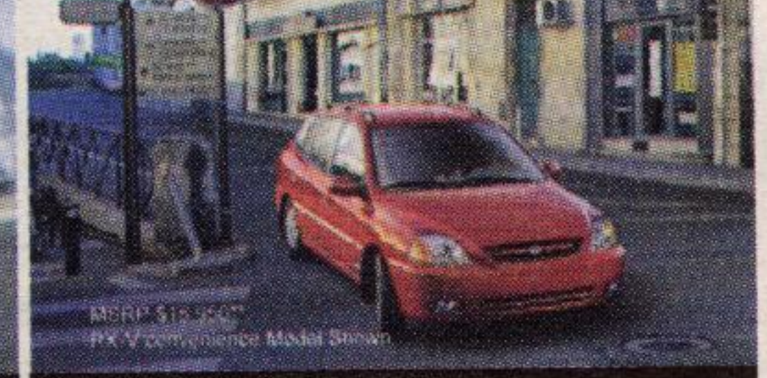
The Fun to Drive 2003 RIO RX-V

• 1.6L DOHC engine • 5-speed manual transmission • Dual airbags • AM/FM/CD stereo • Steel side-impact door beams • Driver's seat lumbar support • With over 60 Standard features