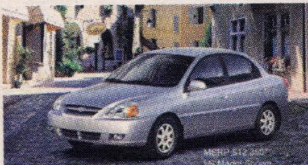
The #1 Value Leader 2003 RIO S