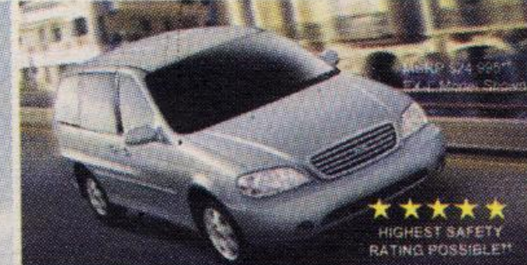
World Class Safety 2003 SEDONA LX