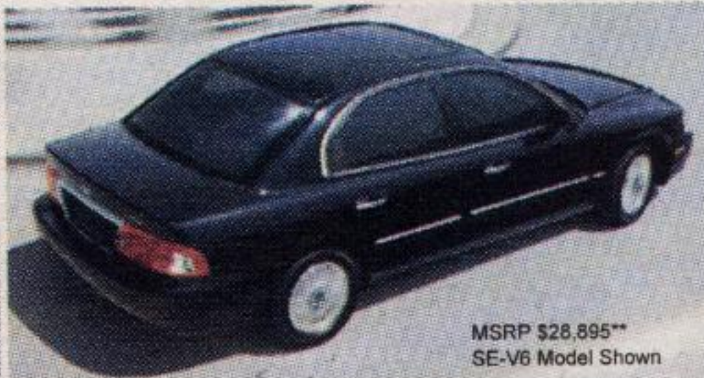
The Re-designed 2003 MAGENTIS LX