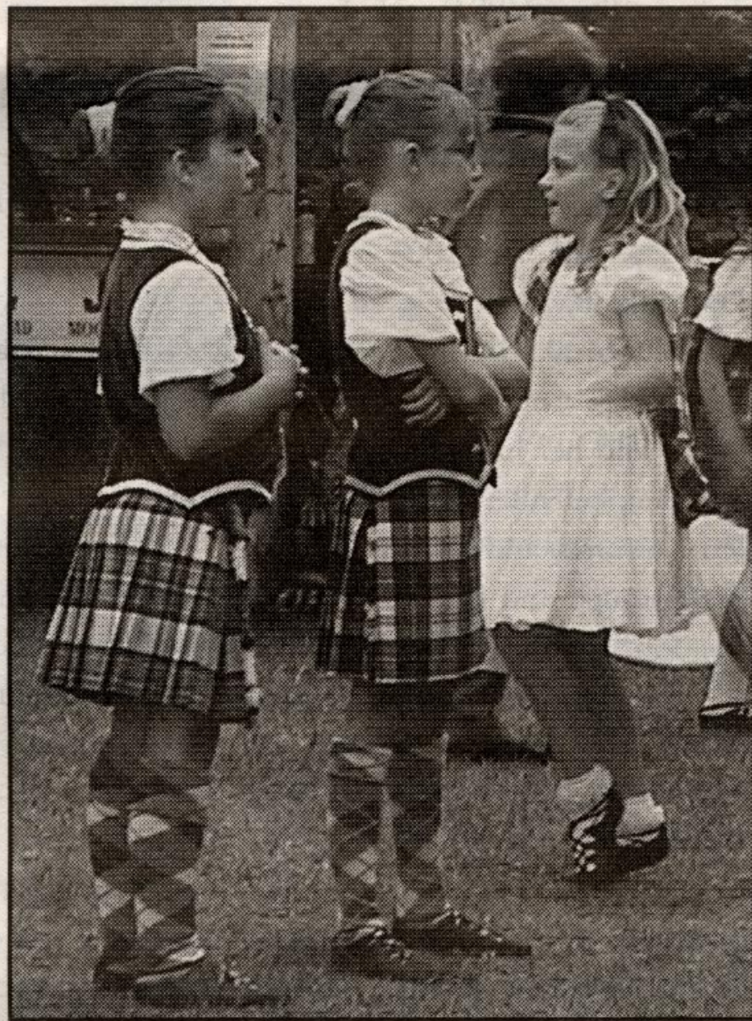
Waiting to dance

The well-attended event proved that the moral choice for these animal lovers is a generosity of spirit that directly helps animals in need.