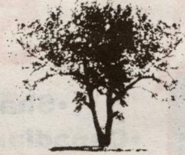
Service Family Tree