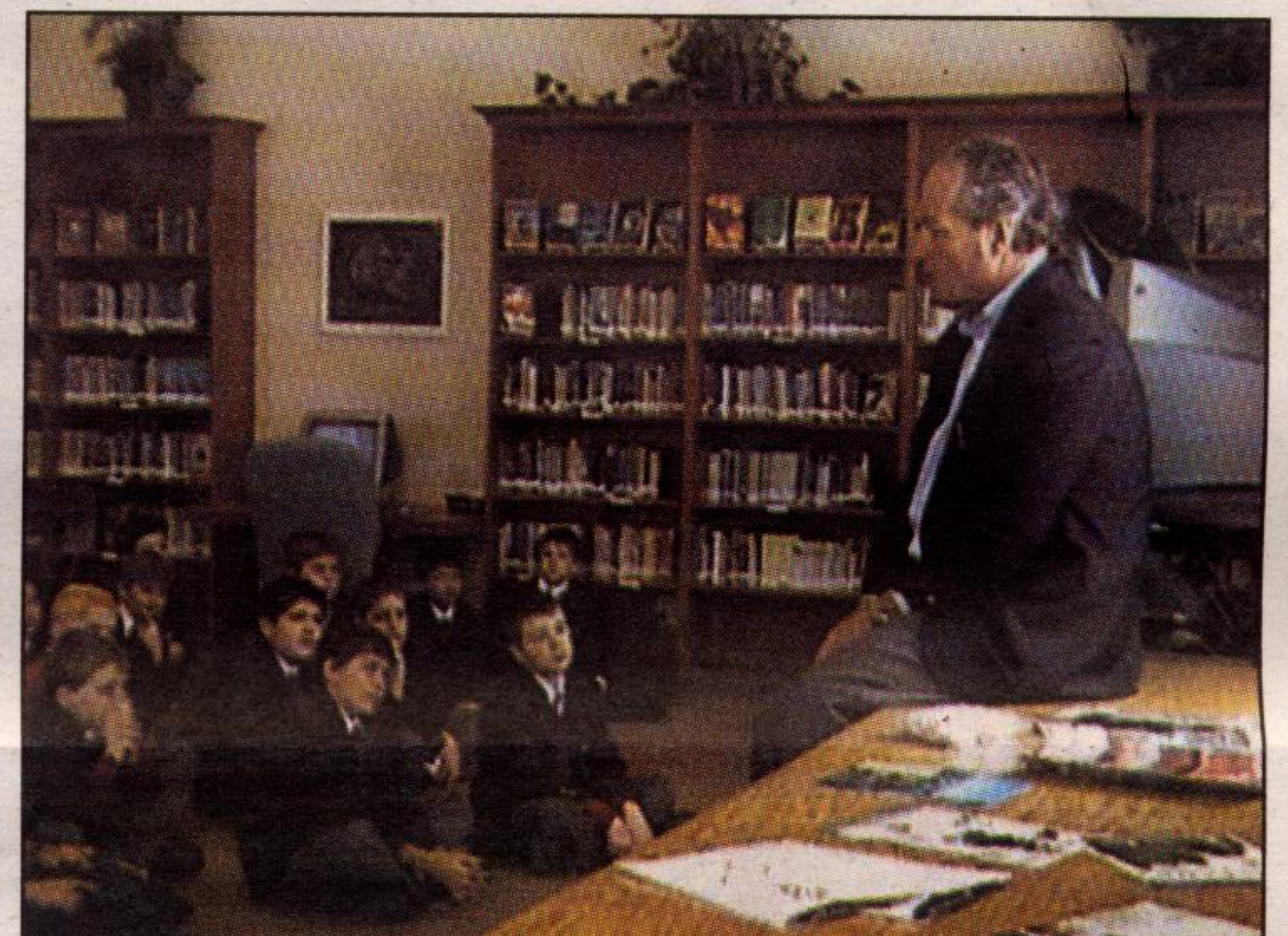
Halton MPP Ted Chudleigh visits with Grade 5 students in North Oakville.