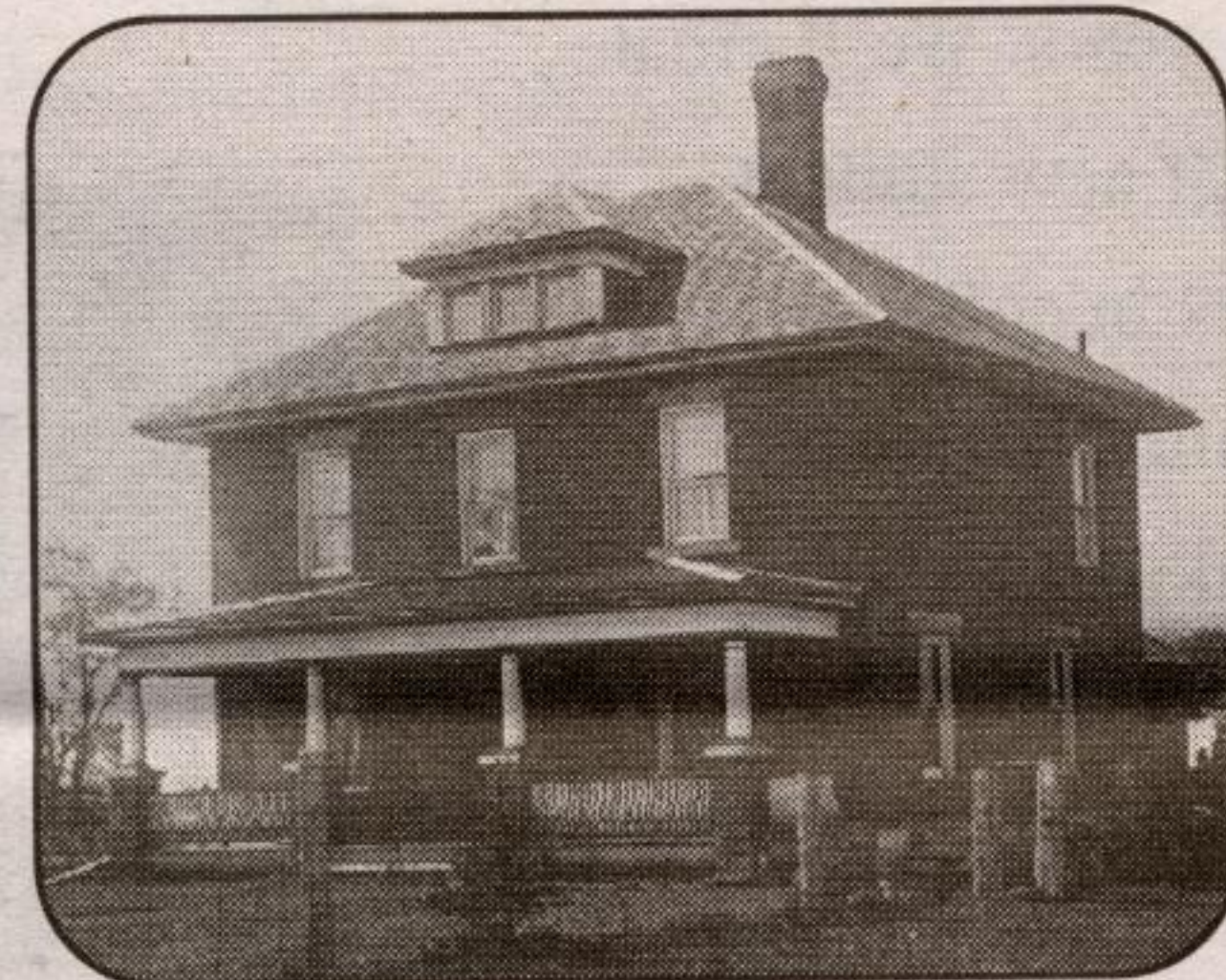
Cole Family House ~ circa 1915 ~