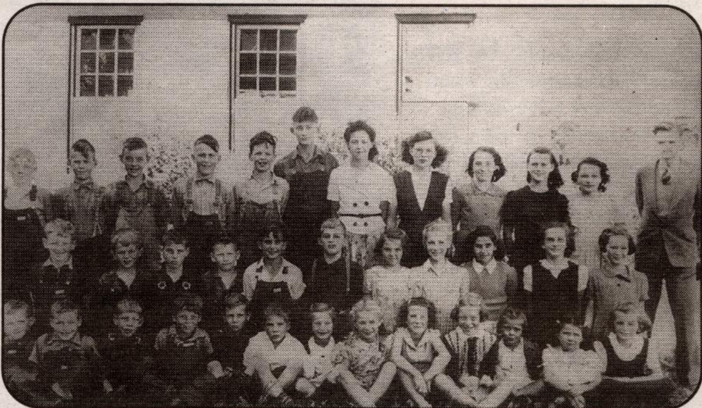
SS#1 Nassagaweya, 3 Sideroad & 2nd Line ~ circa 1946 ~