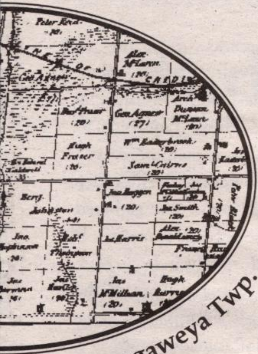
Conc. 1, Nassagaweya Twp.