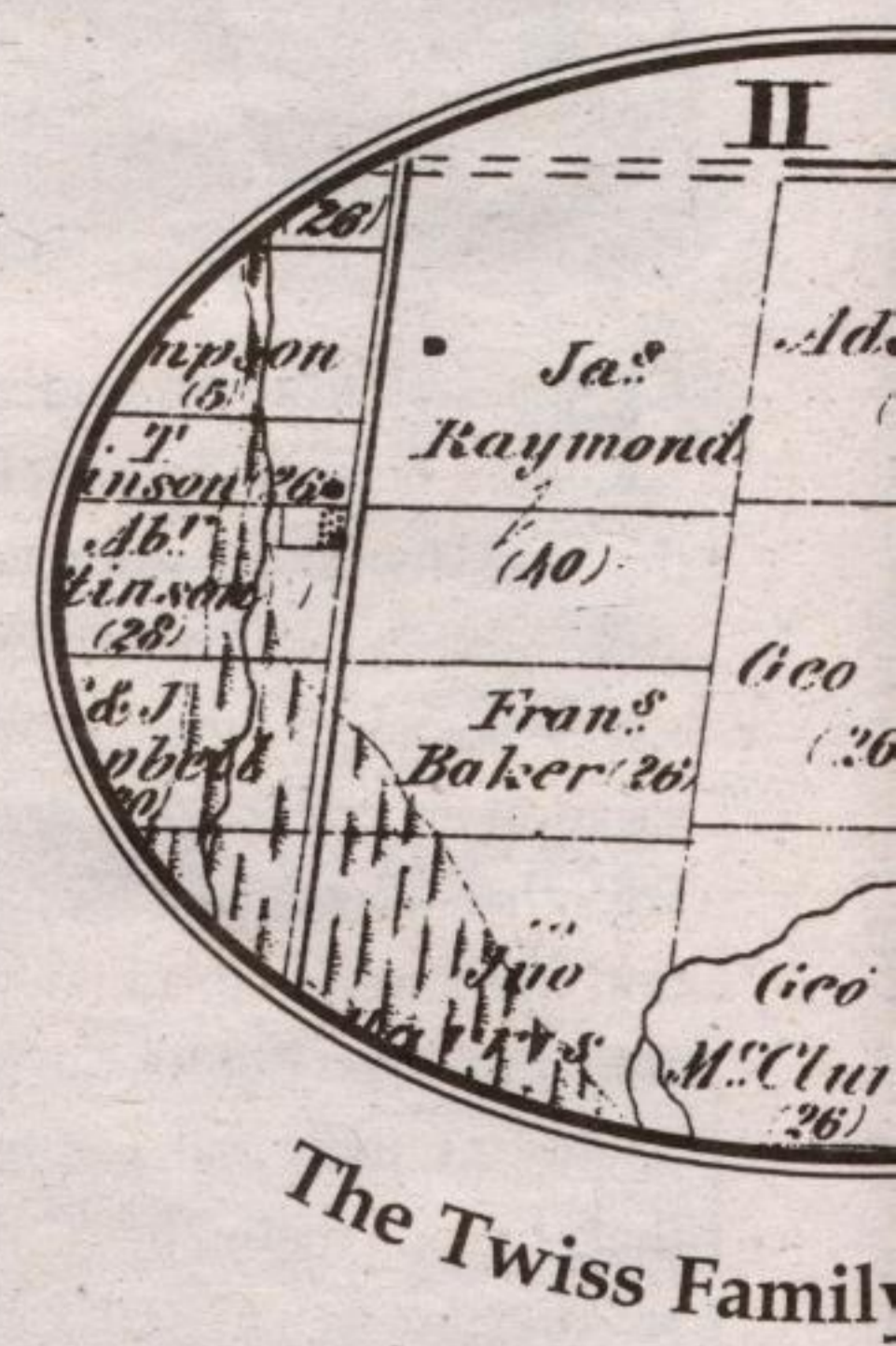
The Twiss Family