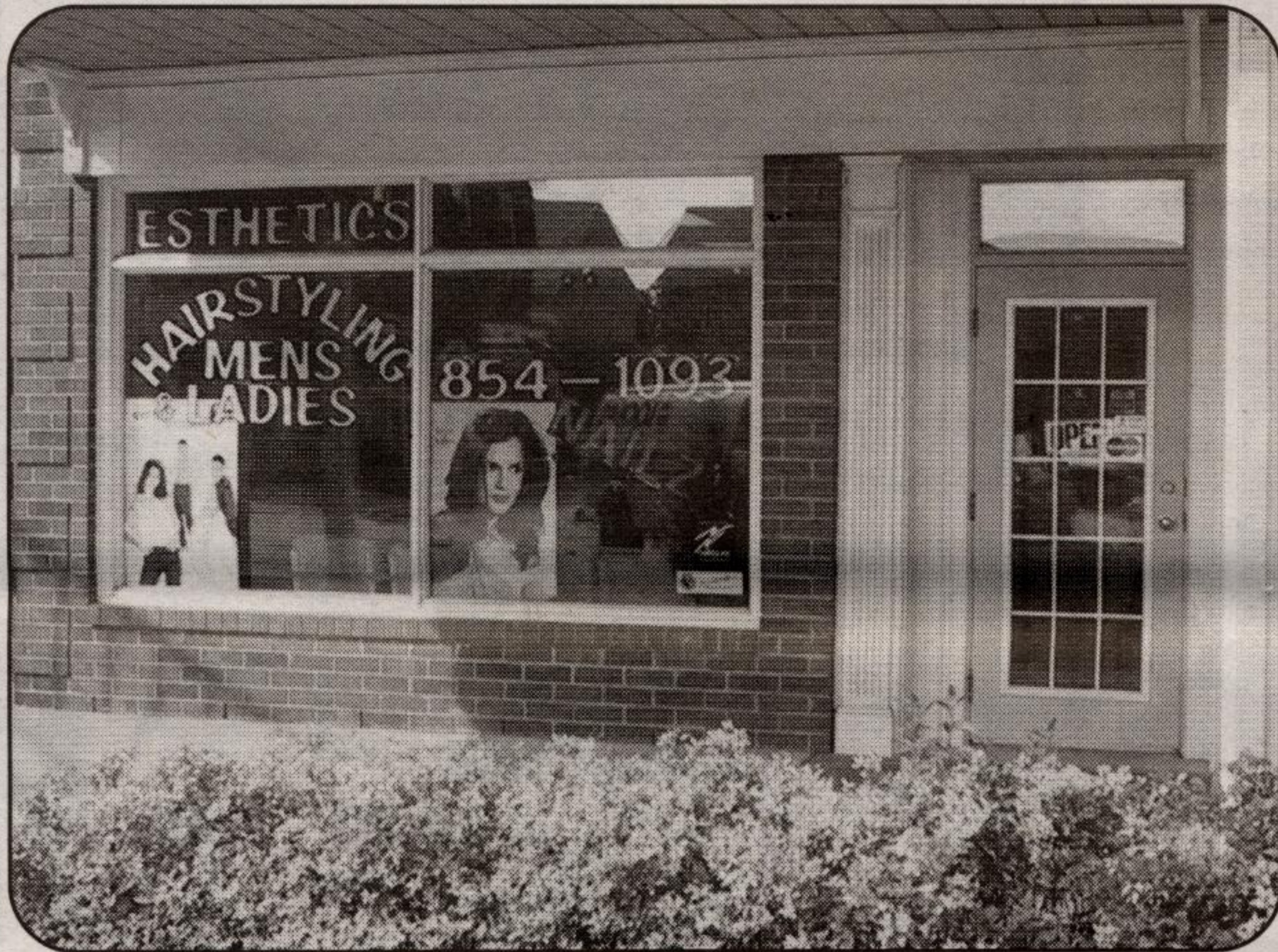
Pro-Care II at Country Meadows Mall, Campbellville

"We thought it was a really good opportunity [to purchase the business]. This spot was the only one in town for any of these services. People feel better when they get something done for themselves, and we'd like to offer that service."