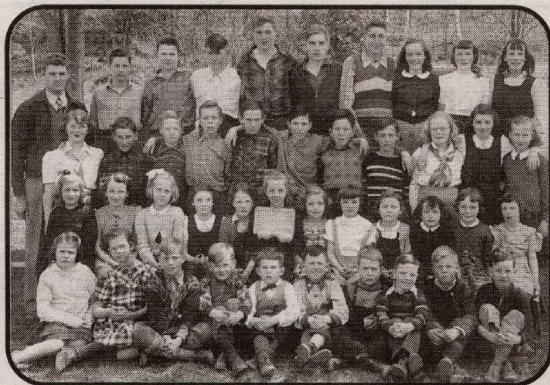
S.S. 10 Campbellville, 1950