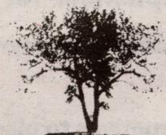
Wheelihan Family Tree