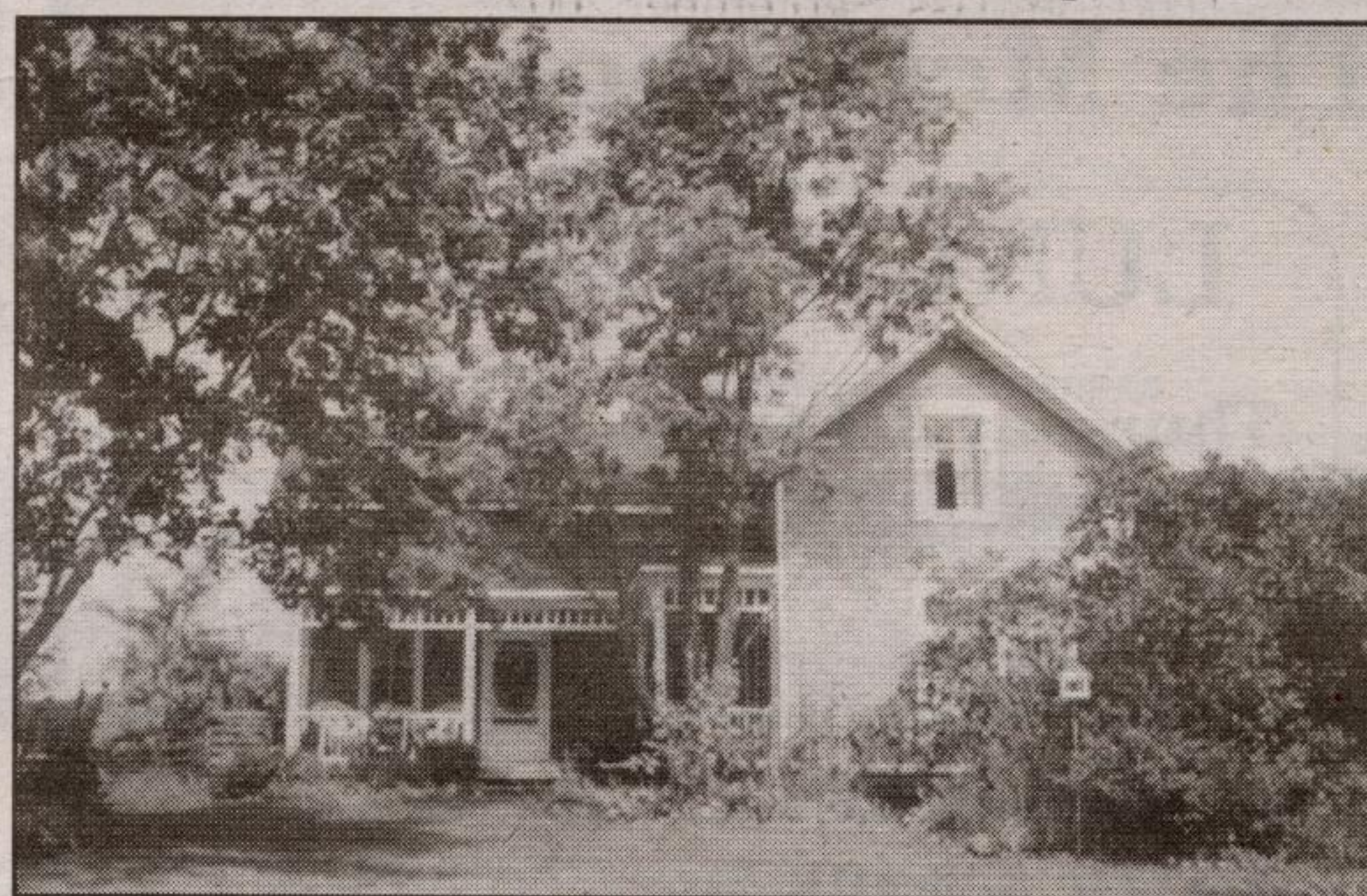
House at Sayers Mills

Two bedrooms became three, using wasted hall space and vintage doors, trim and flooring purchased from Al Bousefield, a salvager located one concession over. A second floor laundry, needed storage and closet space were added. A new barn was built using old windows and designed in keeping with the character of the house. Since the early days of responding to emergency repairs and