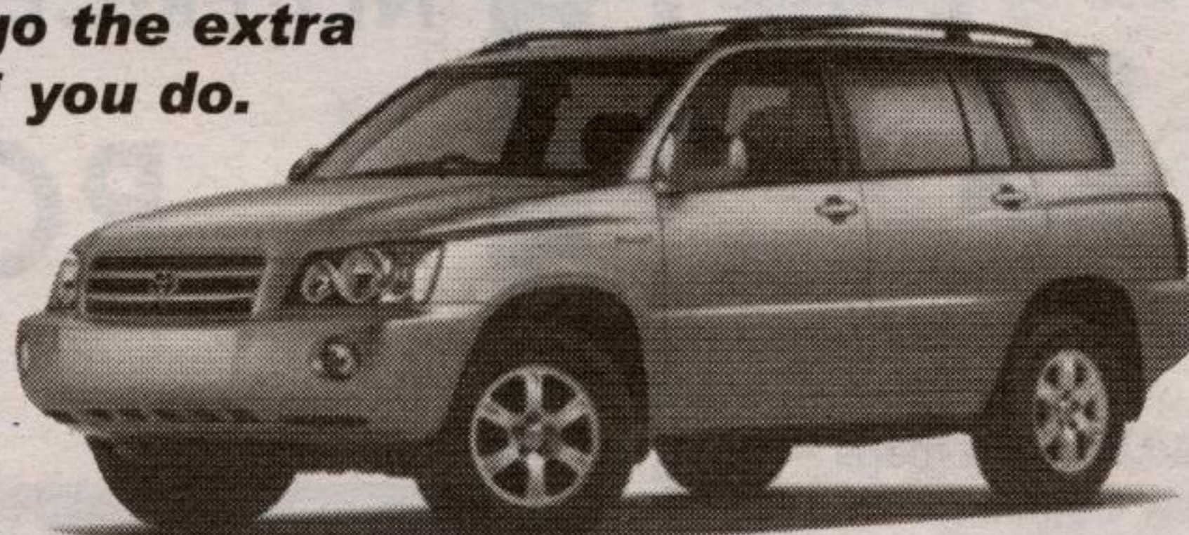
2002 Toyota Highlander