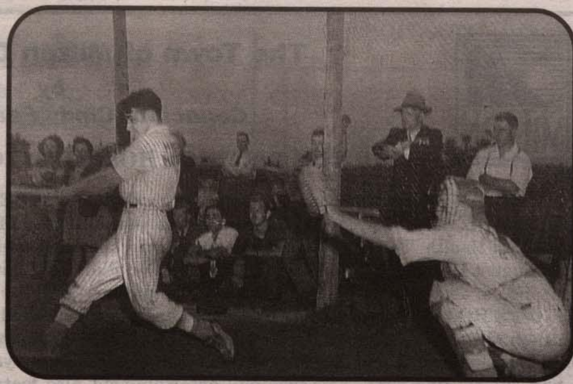
1951 Campbellville Juveniles

Browsers are always welcome 878-6024 184 Main St., East Milton, Ont.