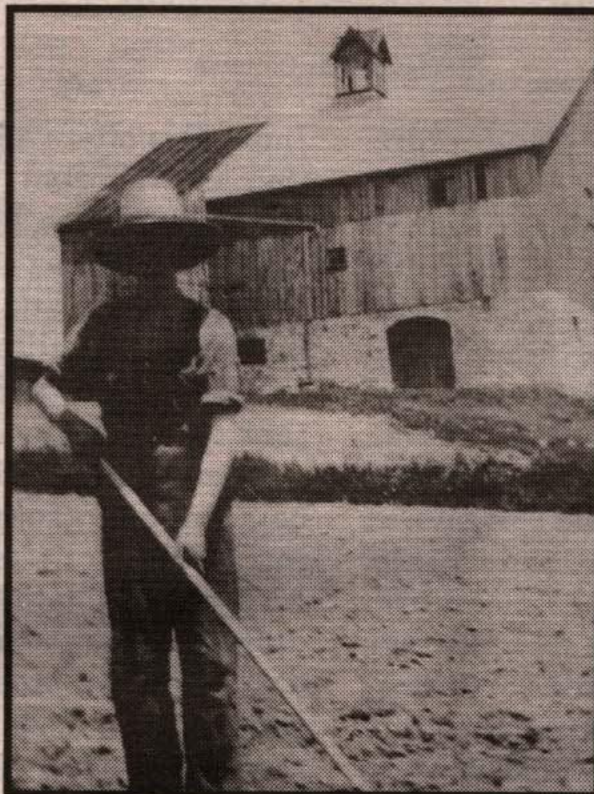
Ruddell Barn - circa 1930