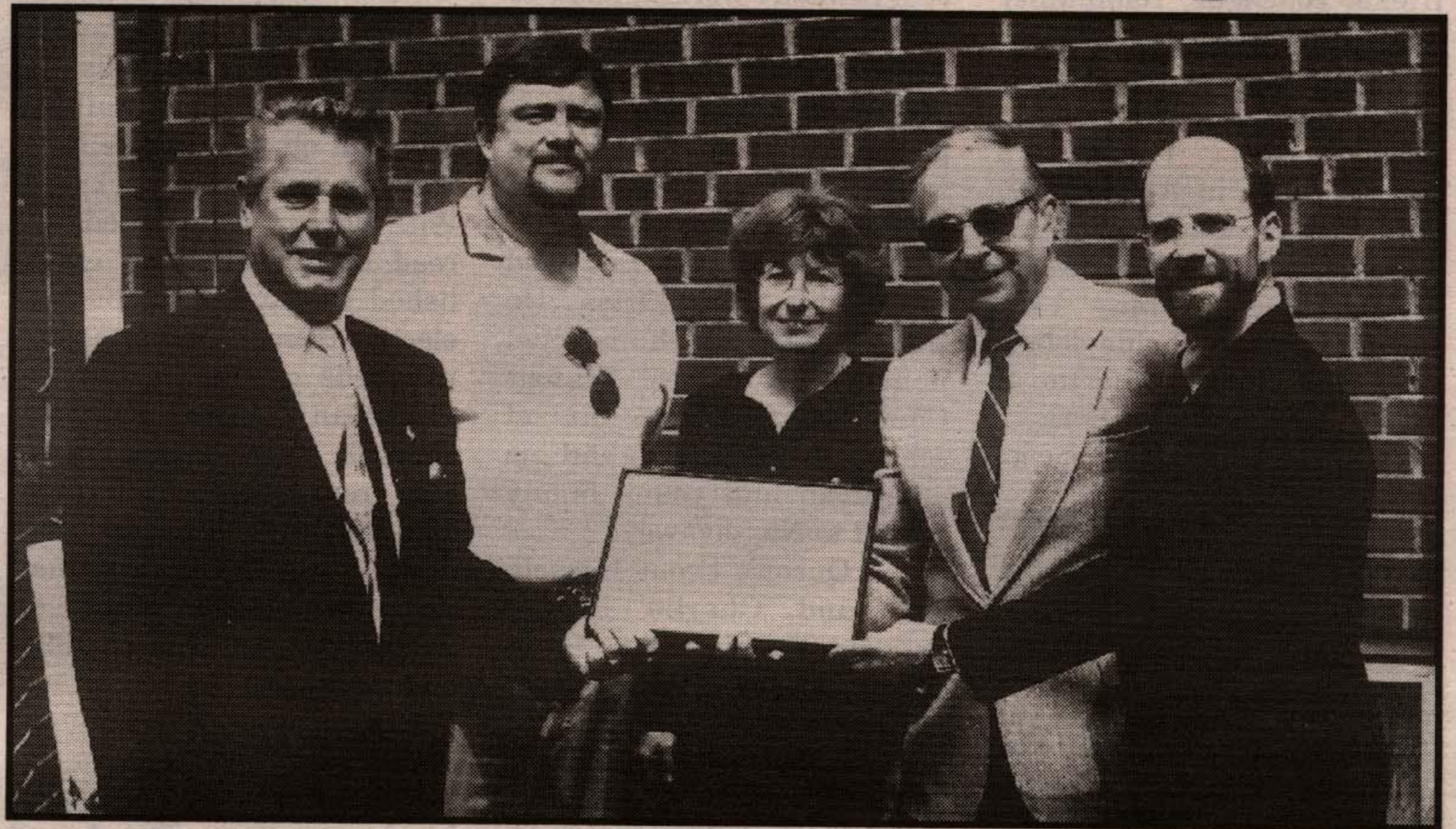
SCADDING AWARD OF EXCELLENCE

preservation of historical records and memorials in the Province of Ontario.