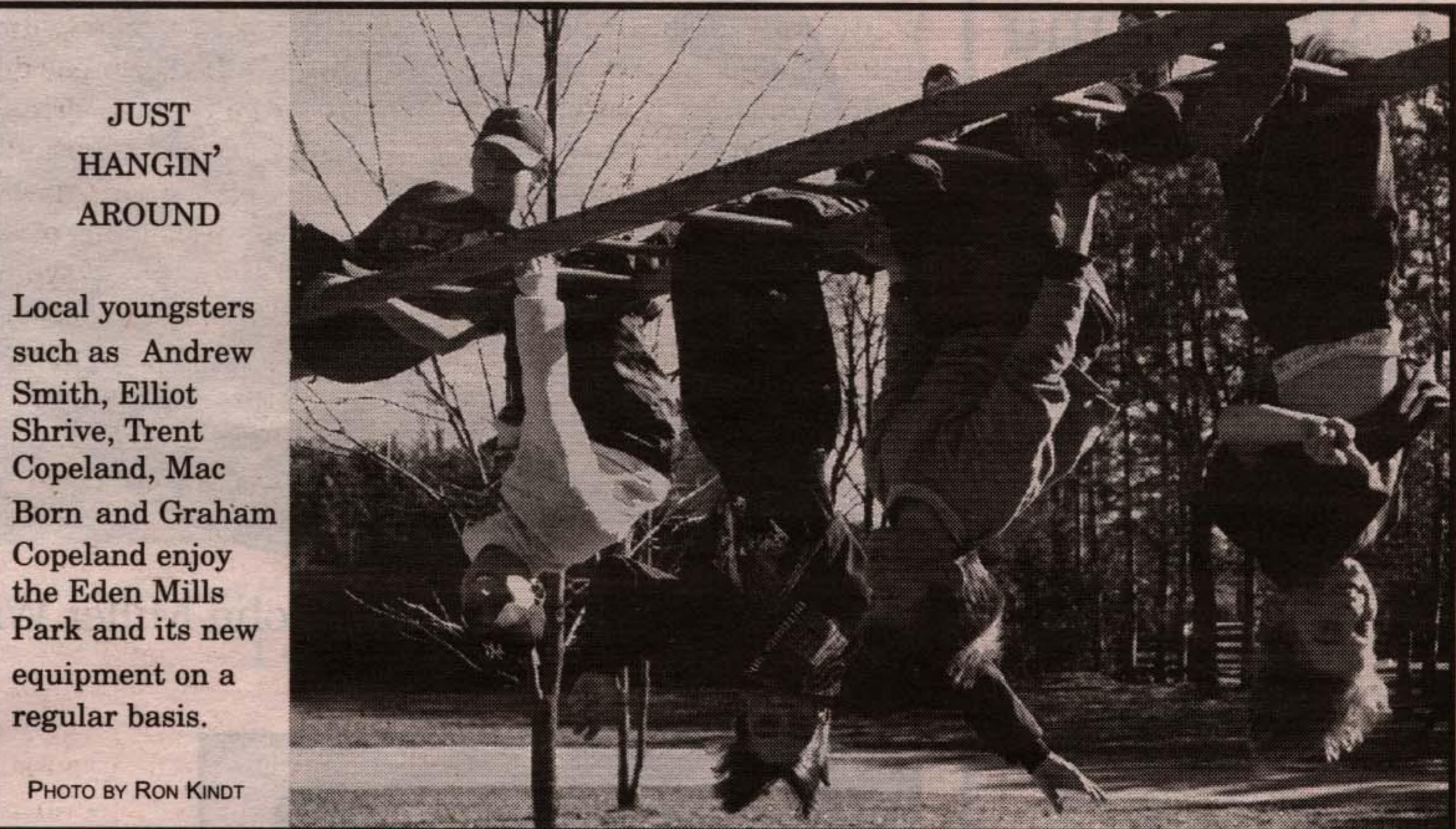
JUST HANGIN' AROUND

The Park Committee's plans did not come at a small cost — an estimated $20,000 was required to complete the three phases. After an inauspicious start, raising $30 on a raffle for a gingerbread house, their fundraising quickly gained momentum. The group has operated a successful teahouse at the annual Eden Mills Writer's Festival