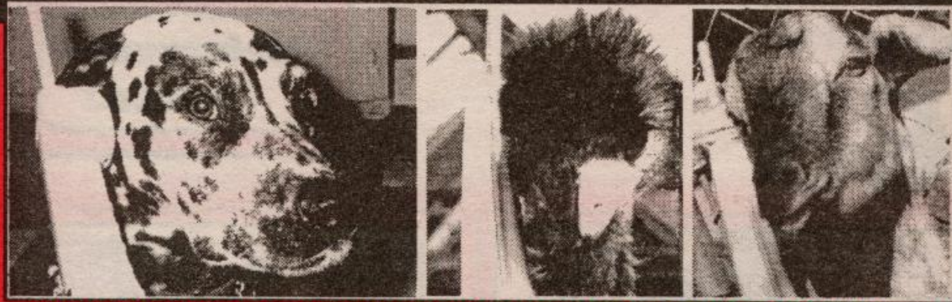
(NO ANIMALS WERE INJURED DURING THIS PHOTO SESSION)

The story continues... Blossom & Toby have an announcement to make.