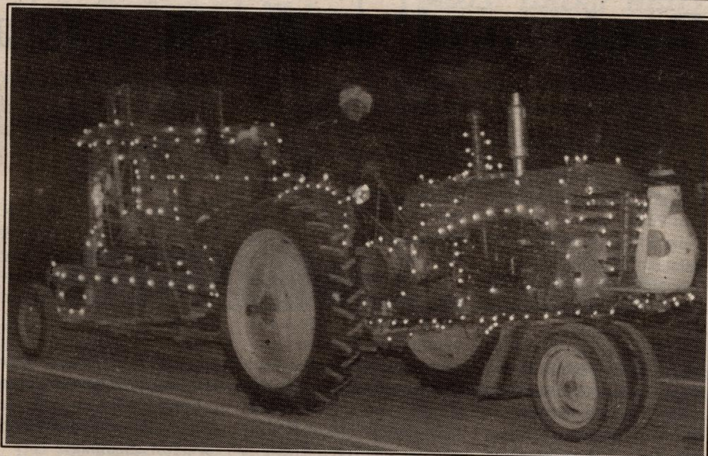
ALL LIT UP: The Farmer's Parade of Lights lit up Rockwood streets shortly before Christmas as area farmers continued the annual tradition of decorating their farm implements with Christmas lights and ornaments.