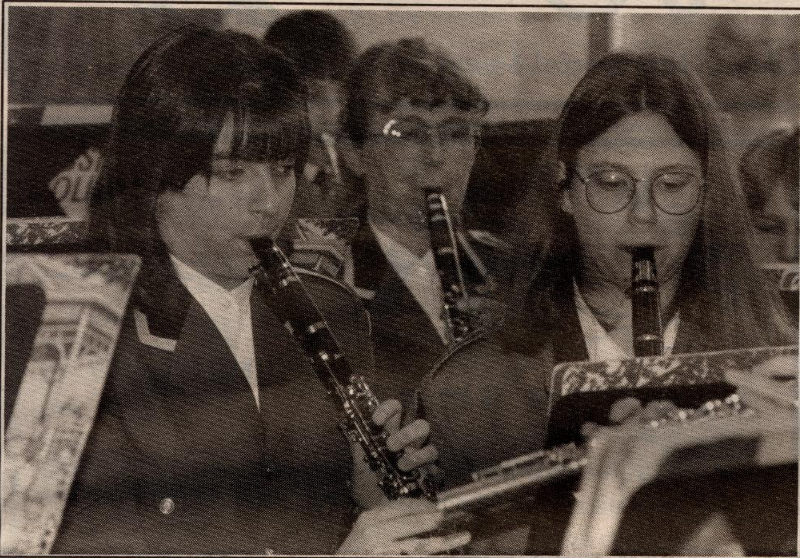
IN TUNE: The Acton Citizens' Band annual Christmas concert took place at the Band Hall recently, with three clarinet players keeping their eyes on their pages as the Band played a selection of seasonal songs.