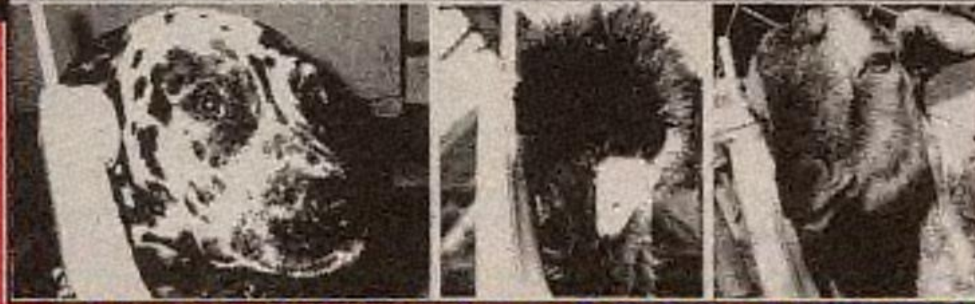
(NO ANIMALS WERE INJURED DURING THIS PHOTO SESSION)