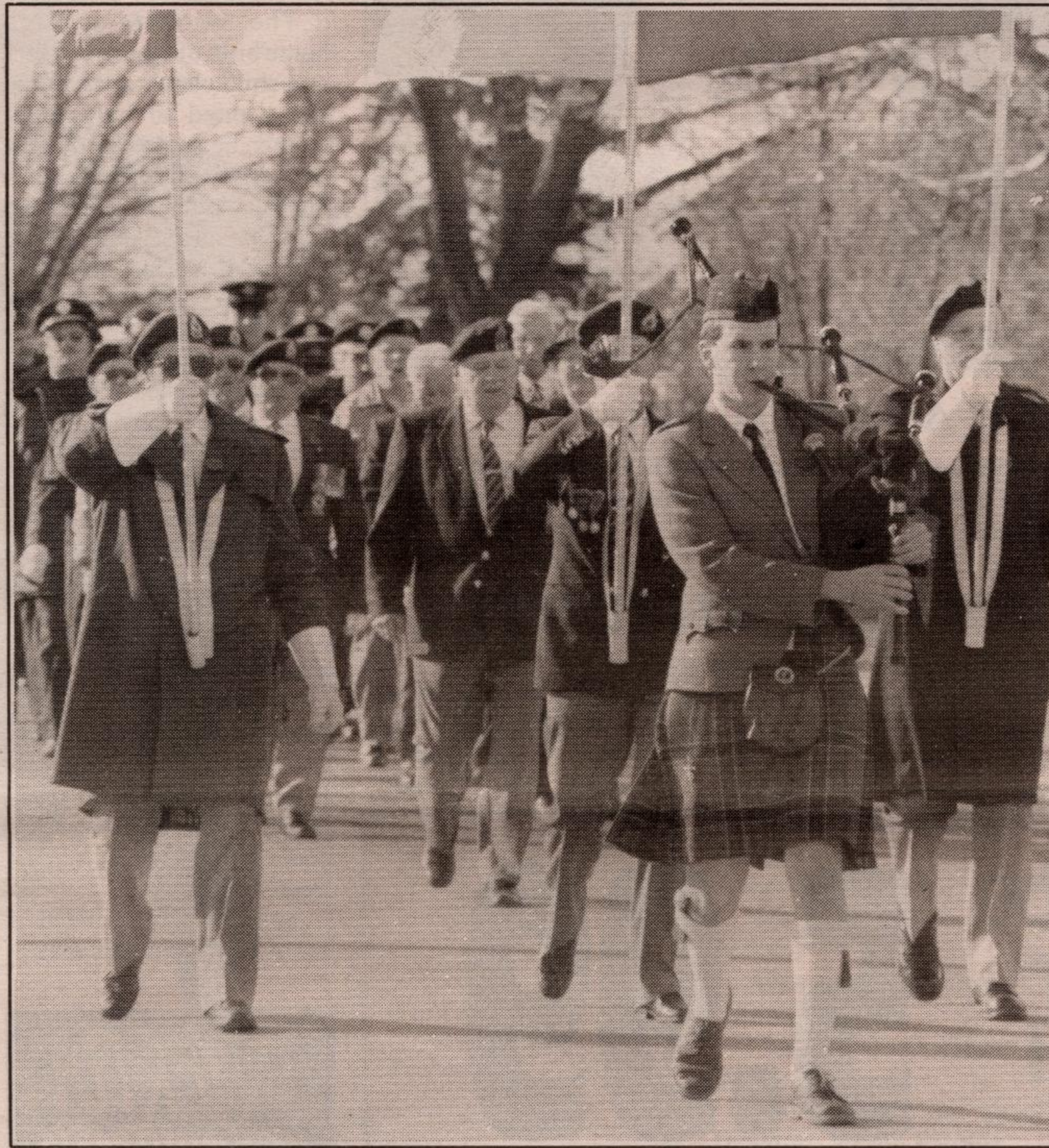
IN REMEMBRANCE: The Remembrance Day parade of veterans, wreath-bearers and others march down Guelph Street to the cenotaph to honour those who died during wars last Sunday morning.