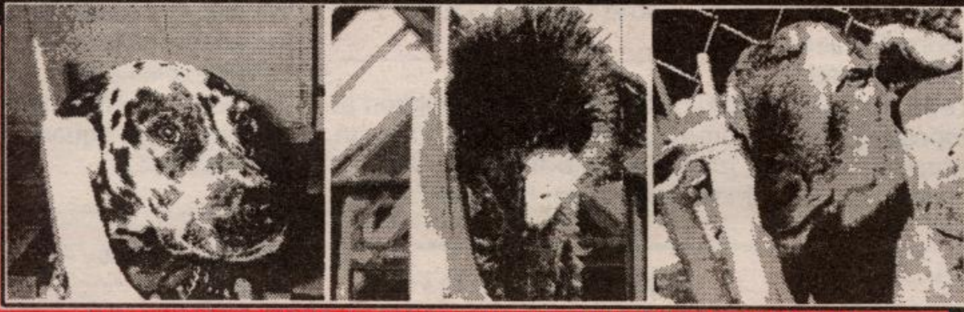
NO ANIMALS WERE INJURED DURING THIS PHOTO SESSION

WAYNE BAGULEY, SALES REP.* Specializing in Country Properties (905) 450-3355 OR (519) 833-0066