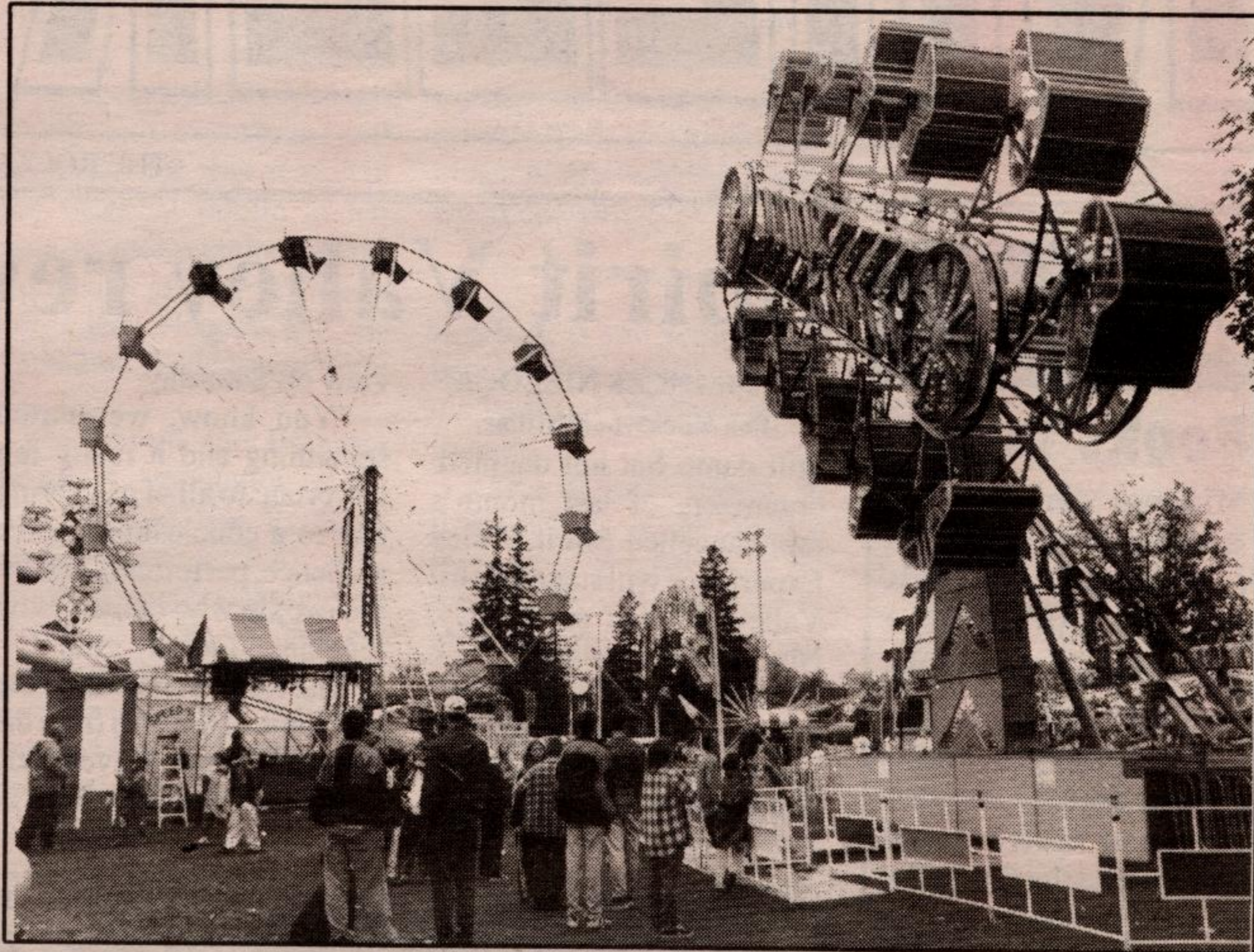
RIDES, RIDES, RIDES! The midway proved to be an attraction to many as thrill-seekers lined up for the ferris wheel and the topsy-turvy Zipper.