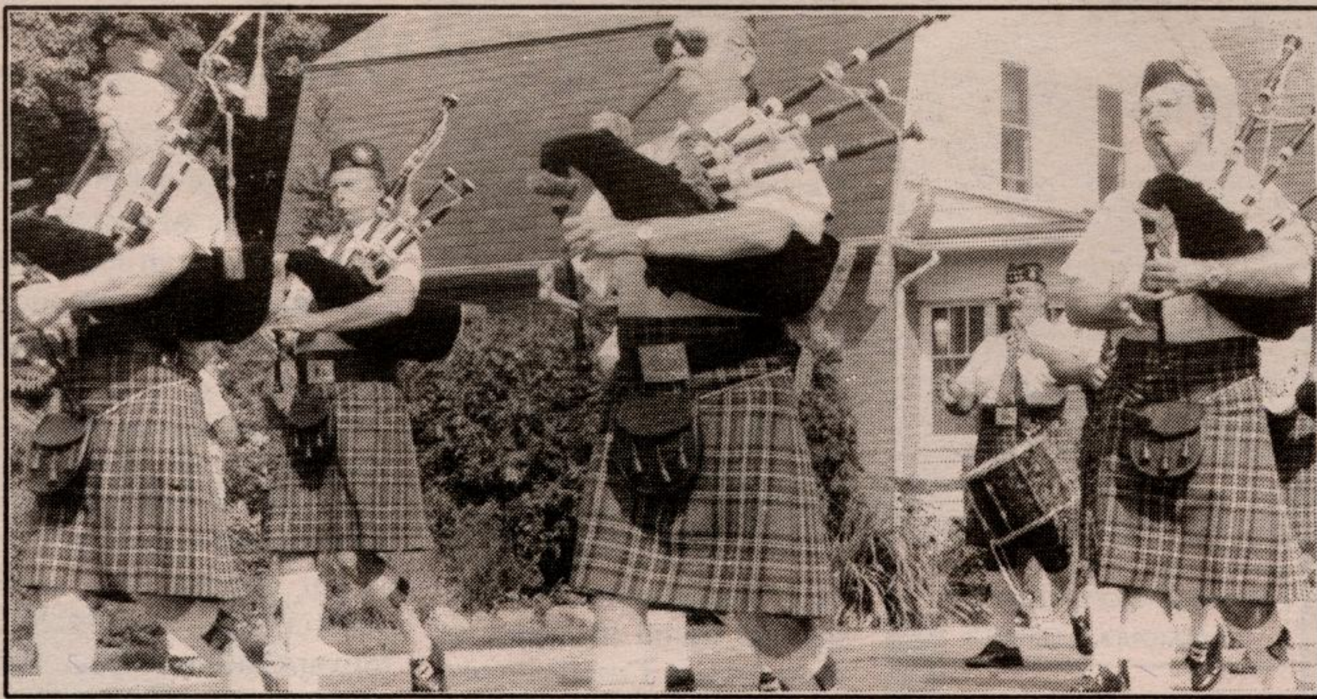
PLAY ON: The Acton Legion band was one of the many attractions to see (and hear) during Saturday's parade down Mill Street.