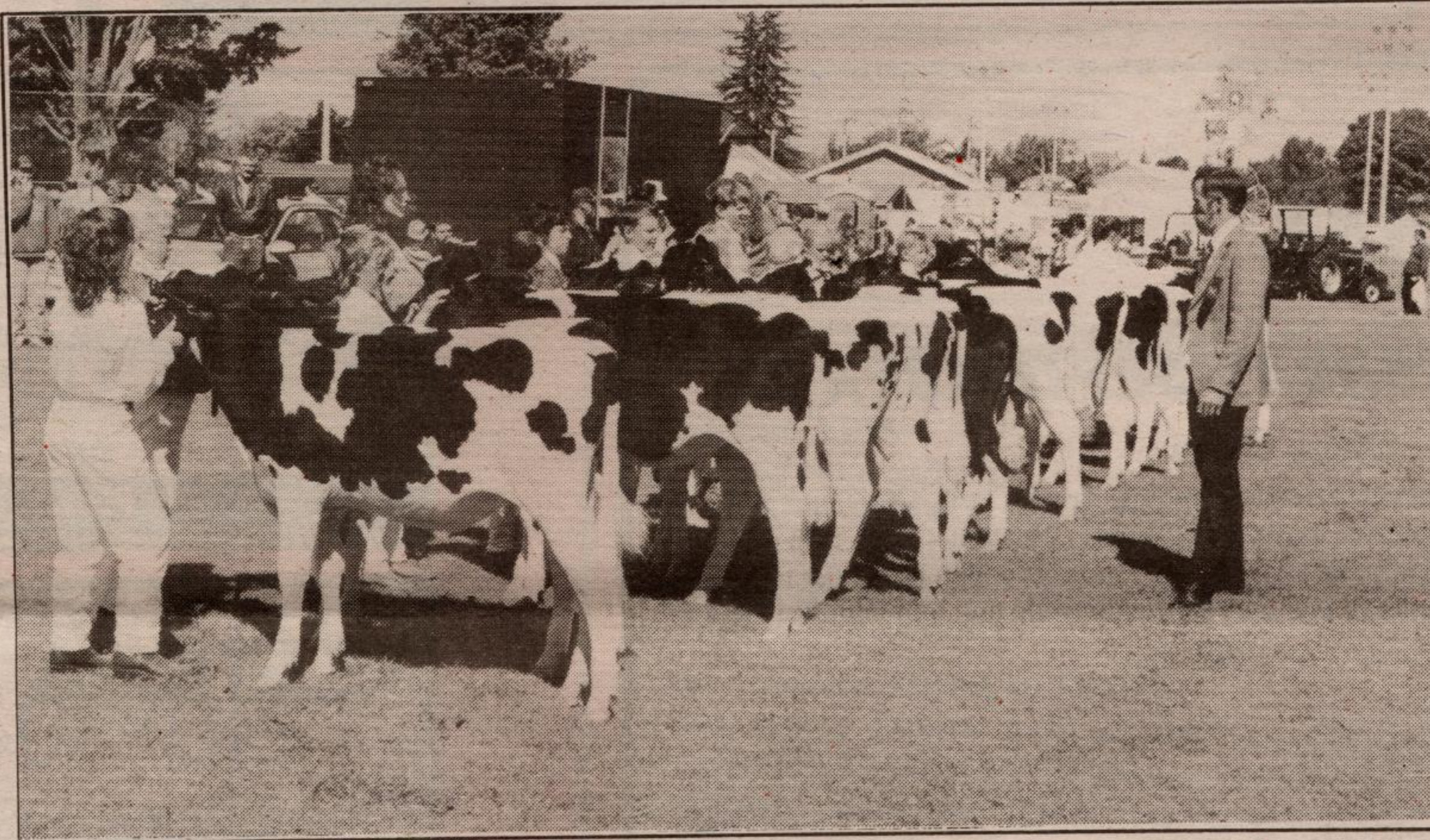
Junior 4-H Show!