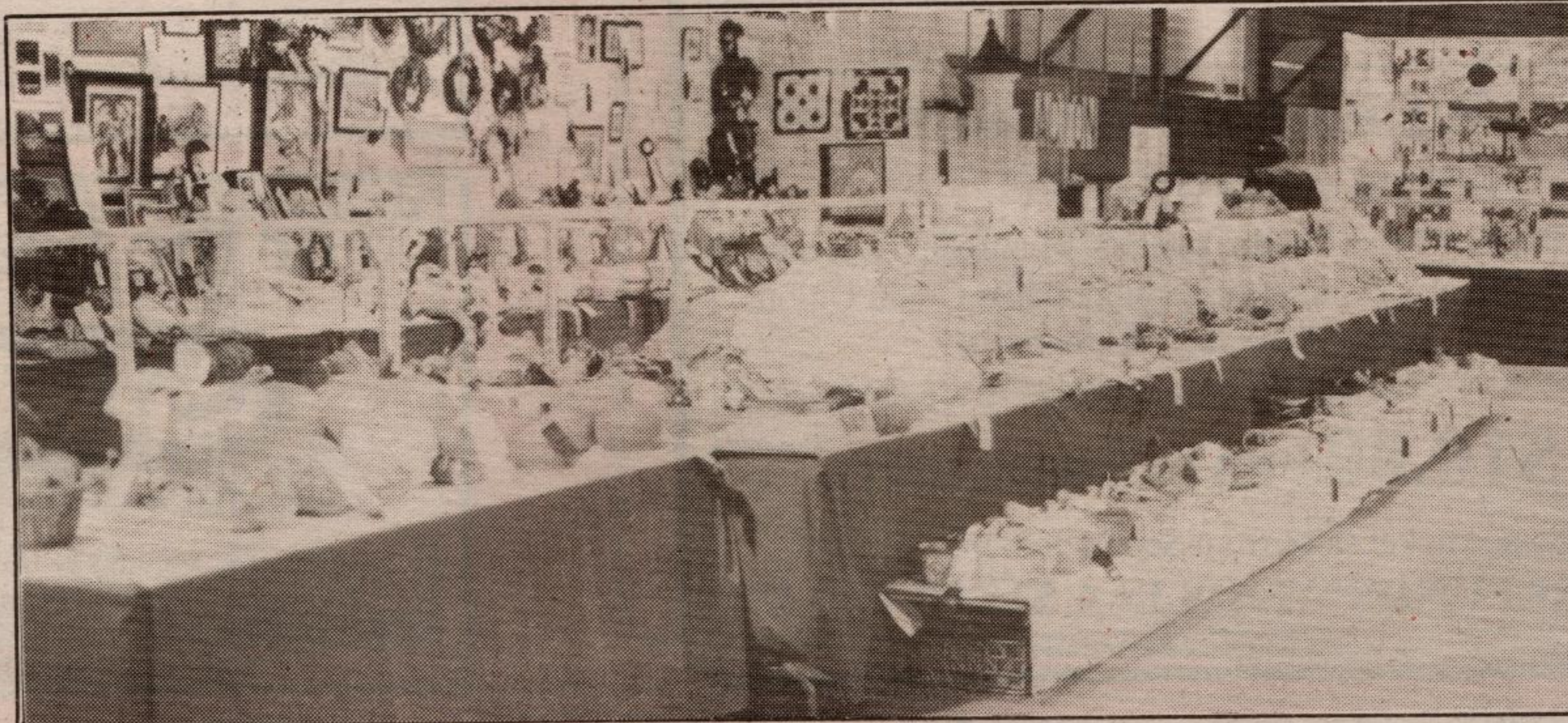
Crafts, vegetables, home baking and much more!