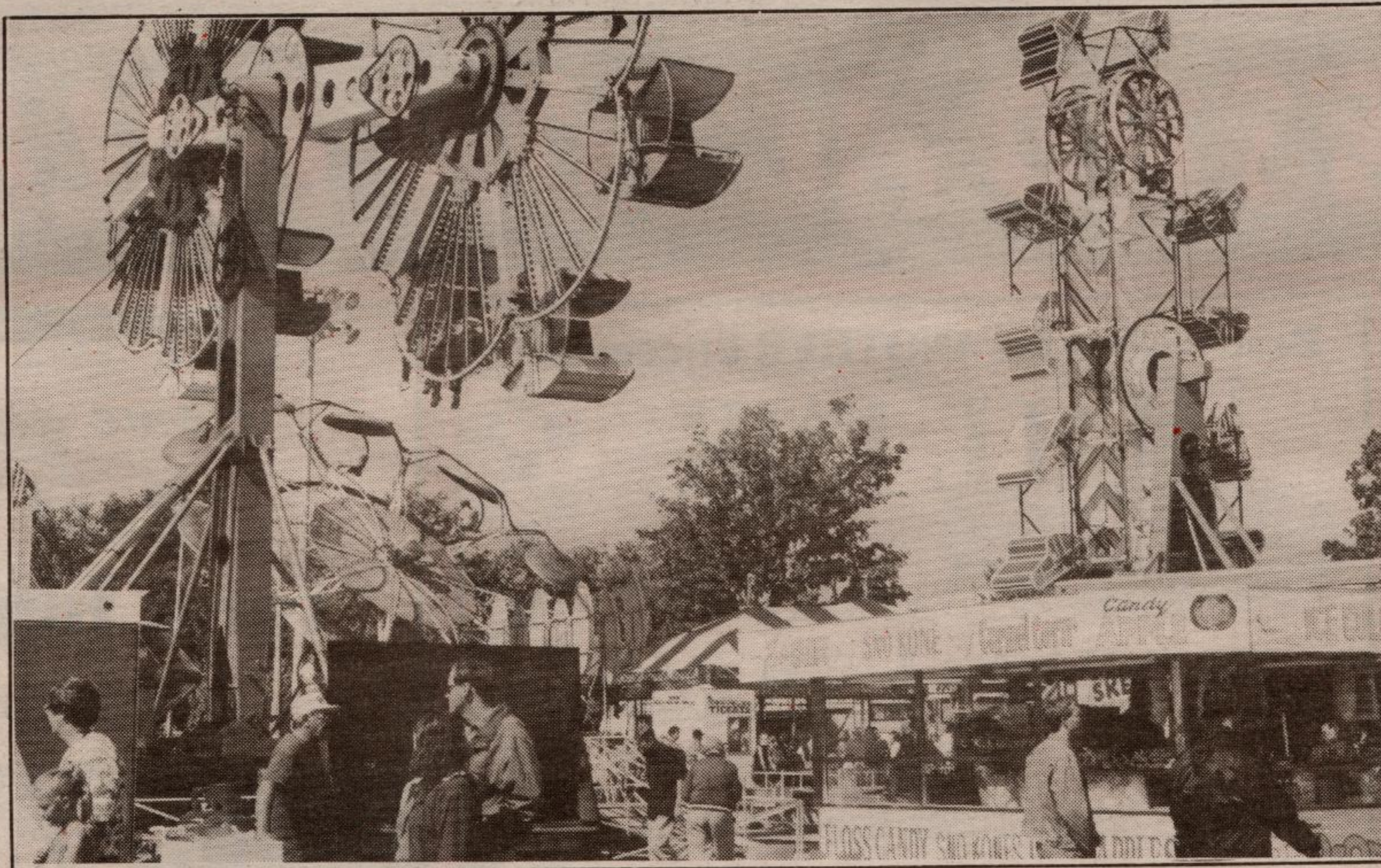
Rides on the Midway!

Wishes you a fun-filled day at the Fair!