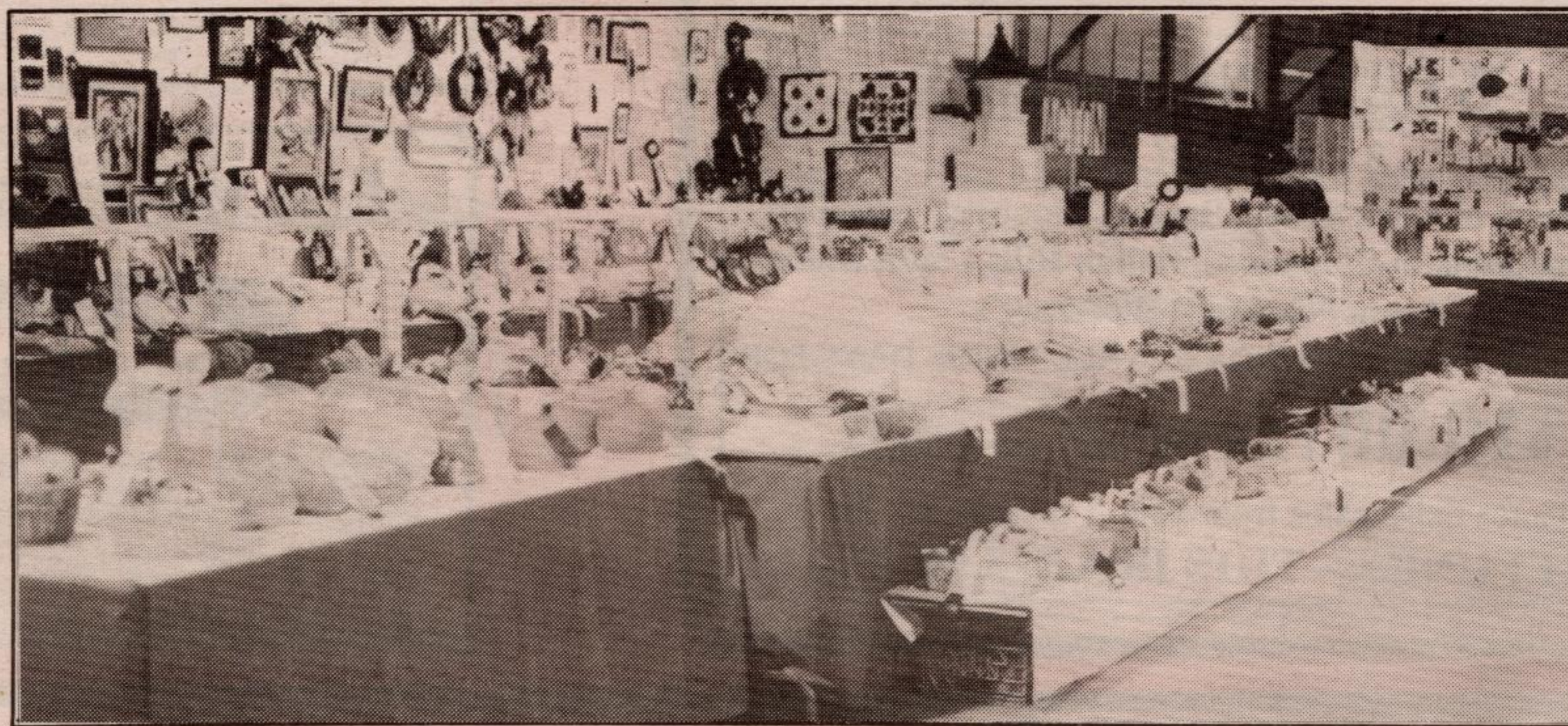
Crafts, vegetables, home baking and much more!