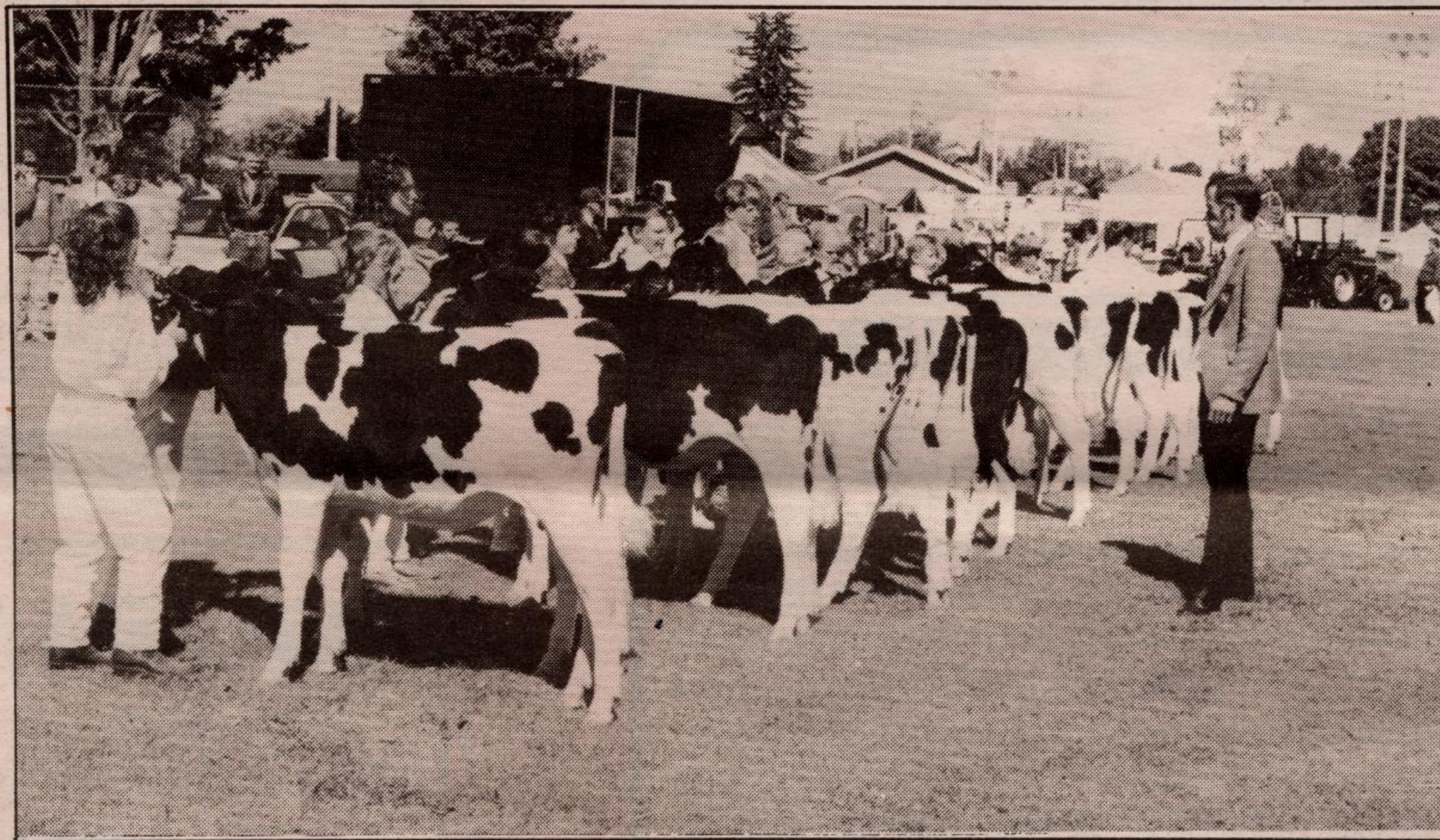
Junior 4-H Show!

Wishes you a fun-filled day at the Fair!