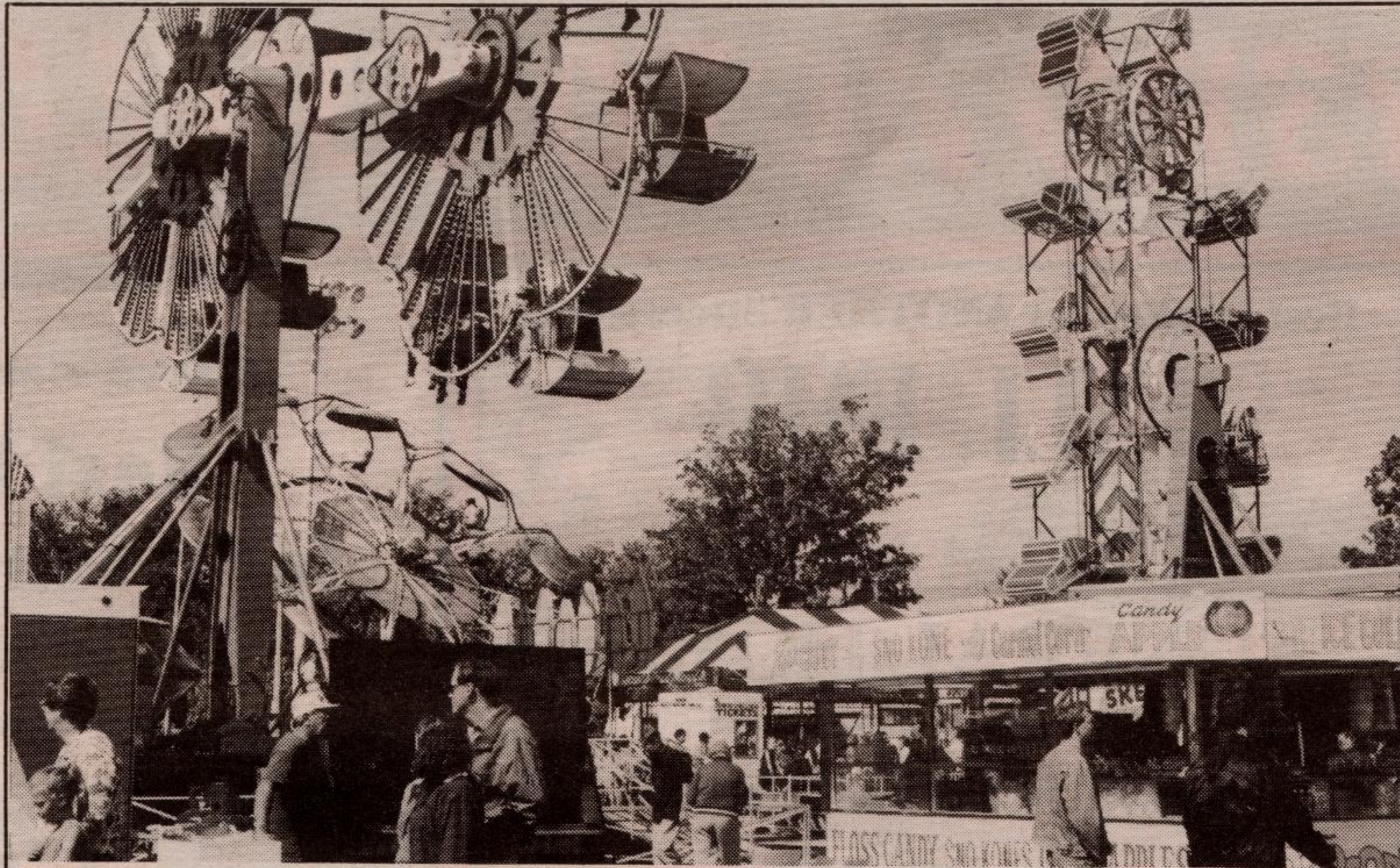
Rides on the Midway!

REMEMBER... Scenes from the 1995 Acton Fall Fair Make your own memories at this year's Fair!