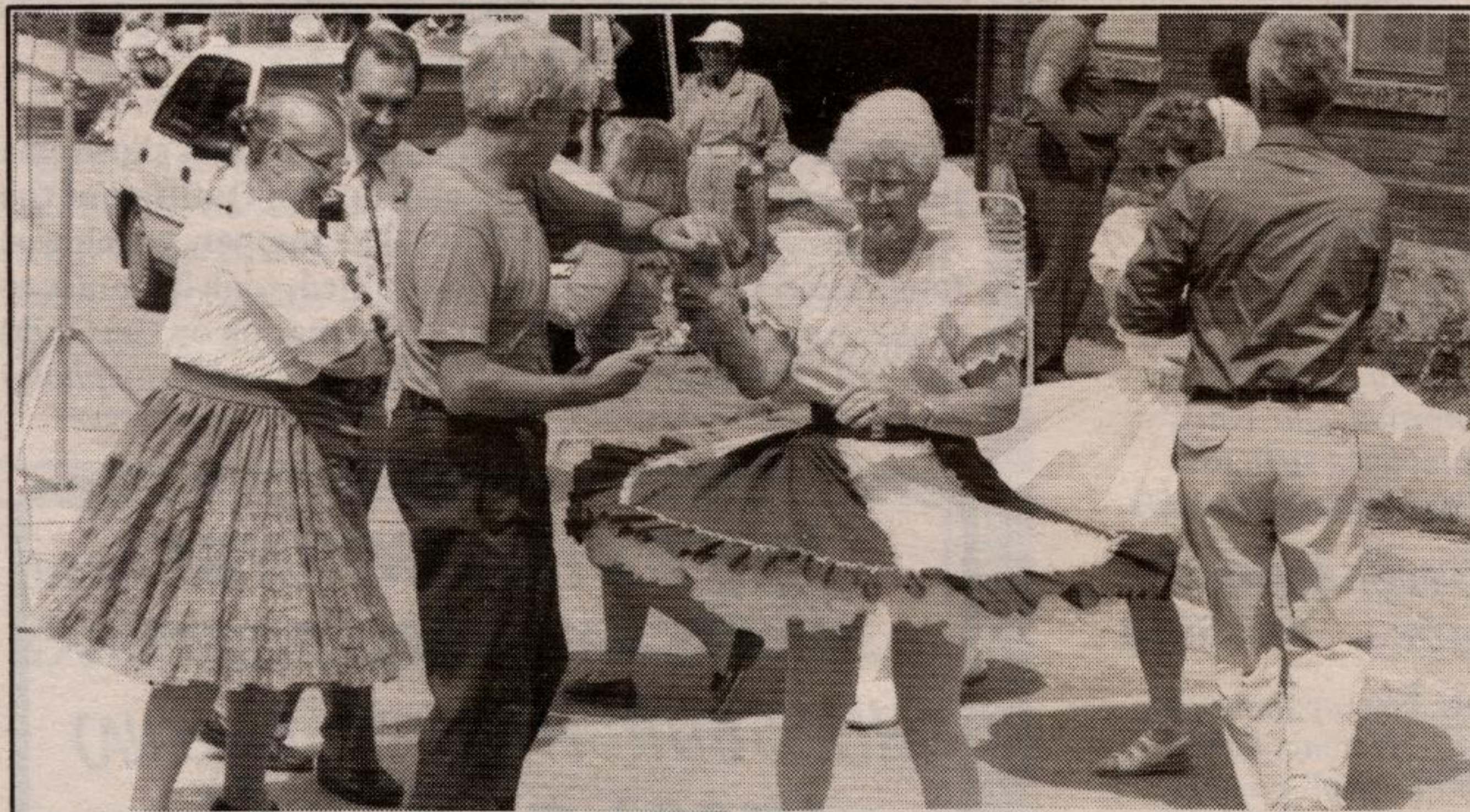
Acton's Star Thru Square Dancers swirled and twirled to the sounds from the caller at the Frederick Street stage throughout the day.