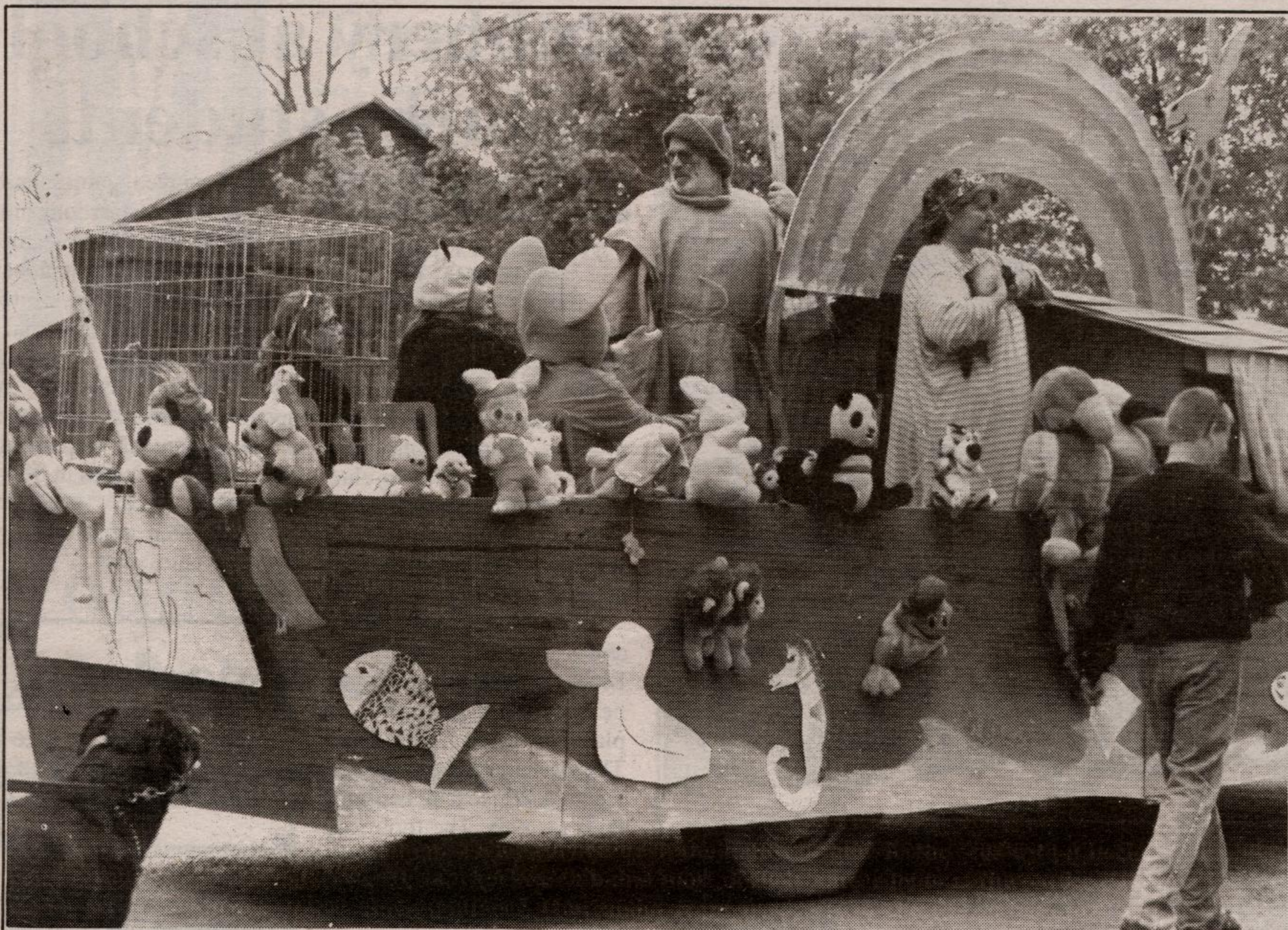
NOAH'S ARK SPOTTED IN ROCKWOOD: What would a parade be without an ark? Well, we're not sure either, but this one, made by the Rockwood Veterinary Clinic for the Pioneer Day parade, definitely added to the festivities of the day.