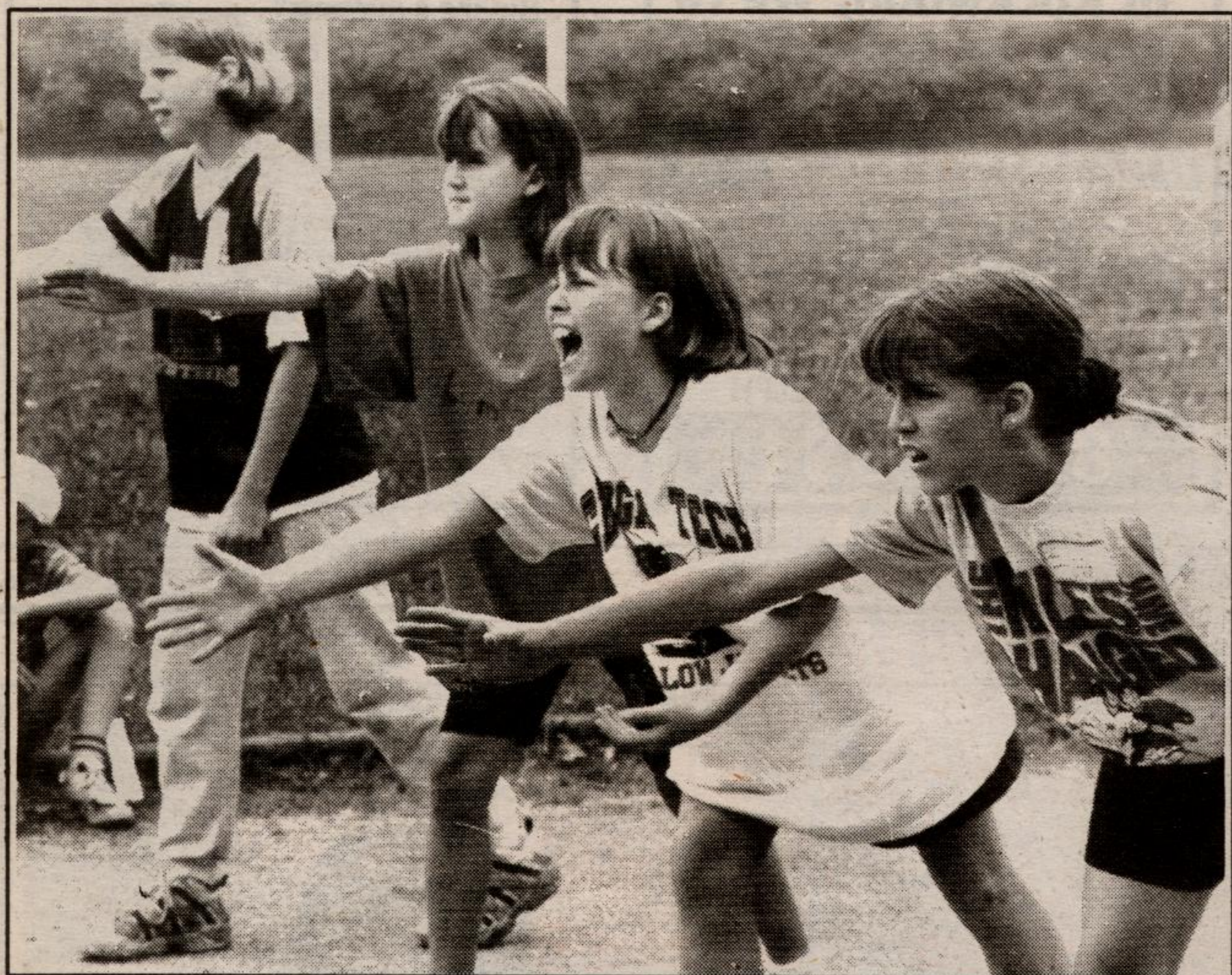
HURRY!! Girls on opposing relay teams shout encouragement to their teammates as they wait for their batons during a 4 x 80 metre relay race at the North Halton track and field championships, held last Wednesday at Acton High.