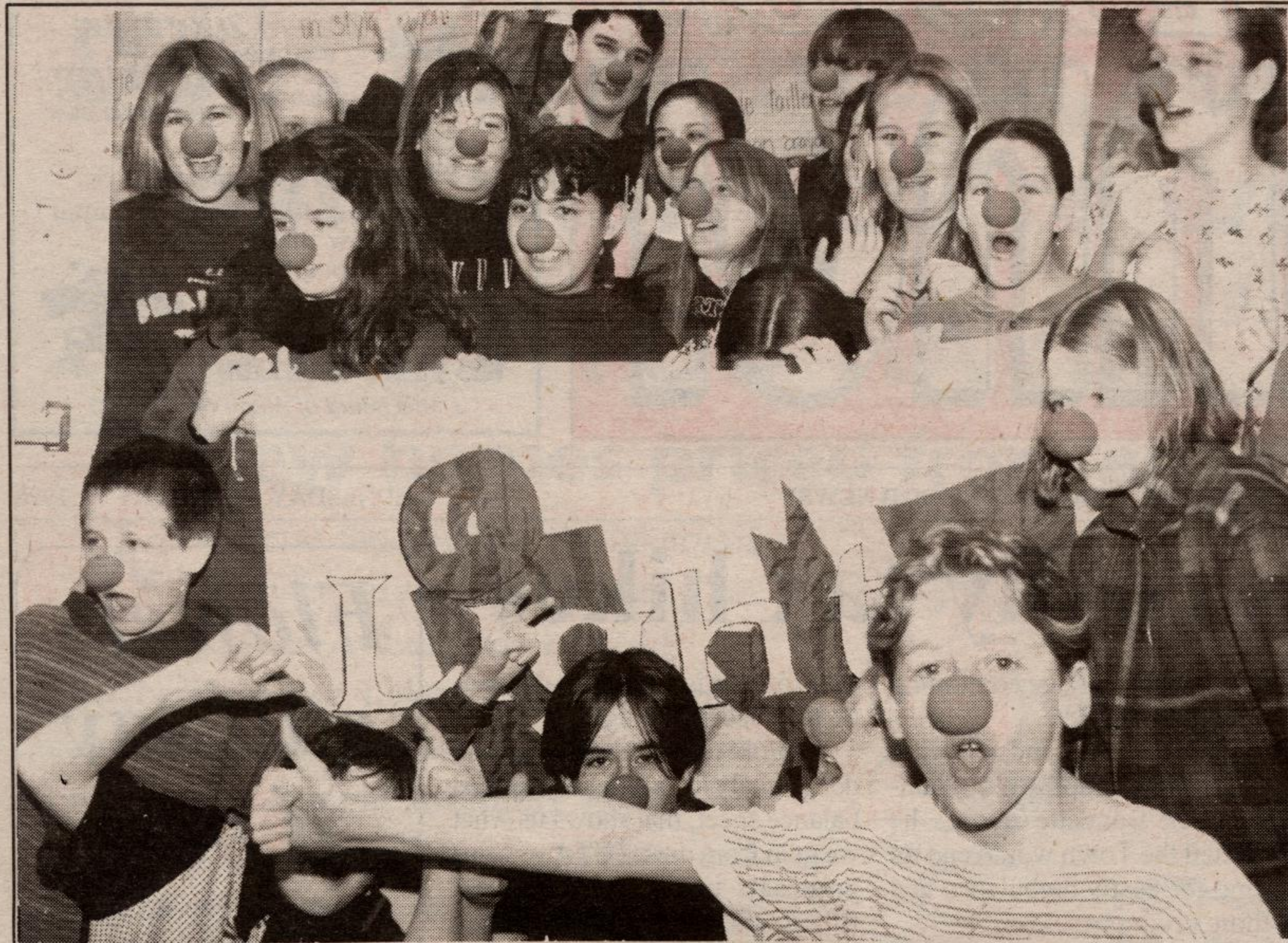
LIGHTEN UP! These rowdy McKenzie-Smith Bennett students donned their red foam noses and whooped it up in the McKenzie-Smith wing last Tuesday for the fifth annual Lighten Up Canada Day celebrations. They also formed a line in the hallway.