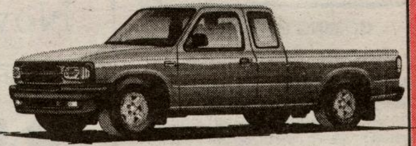
B-Series 4x2 Truck