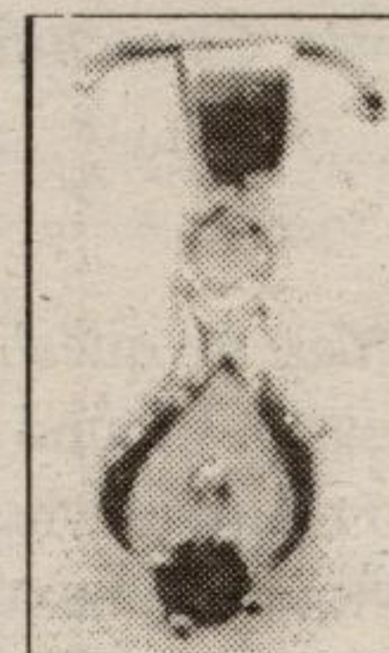
Genuine Ruby Pendant

Regular Price $69 Anniversary Special $29.95