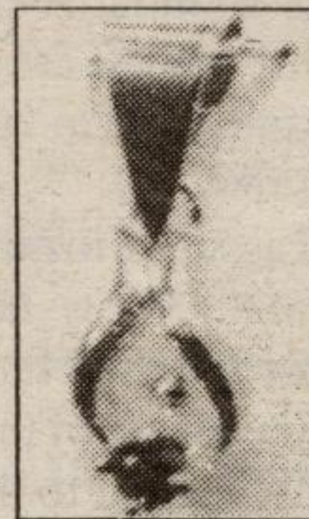
Genuine Sapphire Pendant