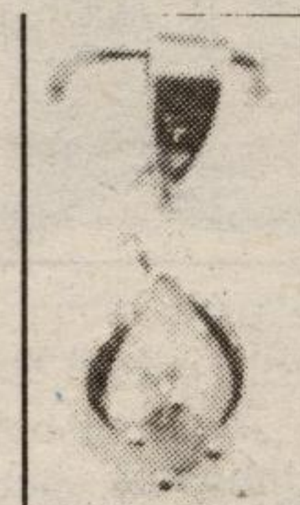
Genuine Crisophase Pendant