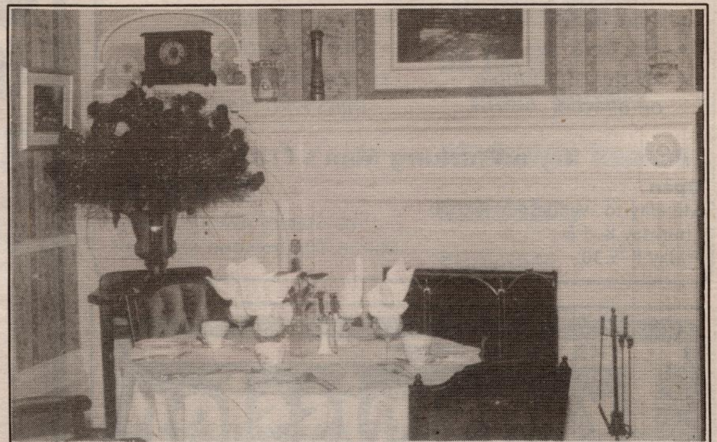
FEATURED RESTAURANT: White linens, fine china and silverware await your presence in the Harrop Restaurant's intimate dining areas.

The Harrop Restaurant & Gallery is a feast for the eyes as well as the palate. Open daily for lunch and dinner.