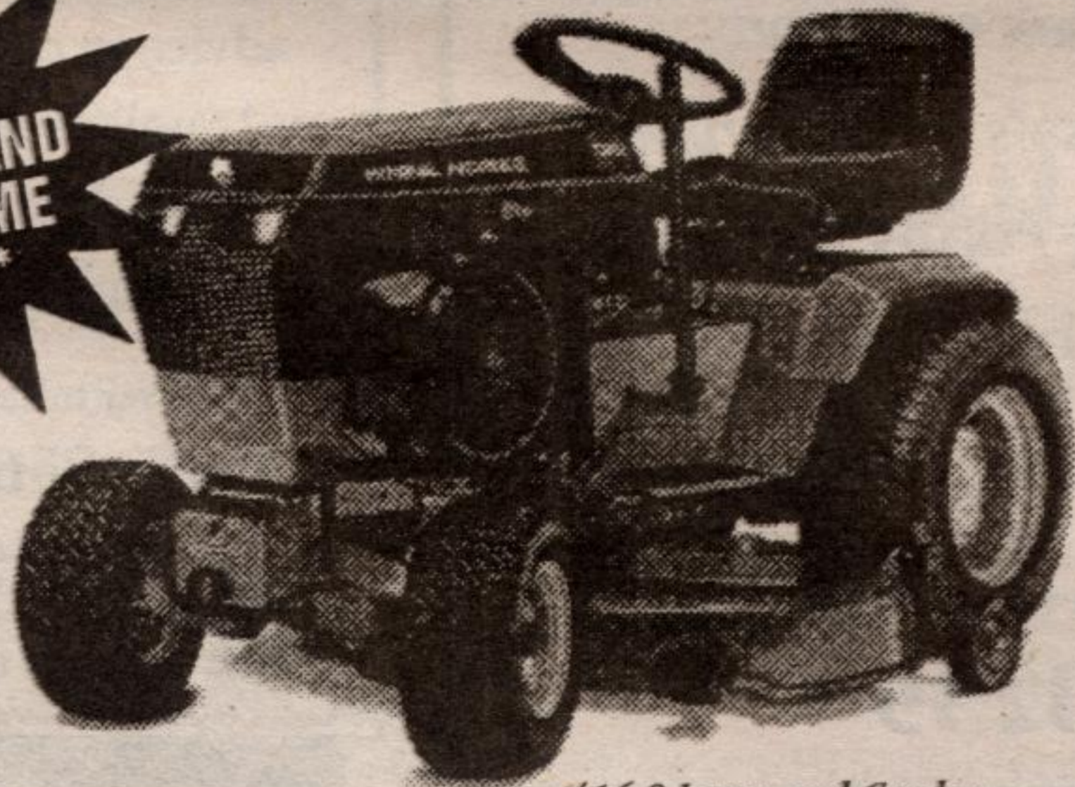
416-8 Lawn and Garden Tractor with 48" mowing deck

BUY NOW AND SAVE SOME GREEN ON A TORO® WHEEL HORSE.®