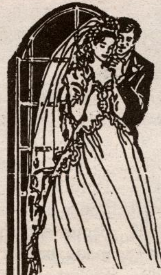
'Wise In The Ways Of Weddings'

Open 7 Days a Week in December until Xmas 164 Wyndham St. N., Downtown Guelph • 767-1317