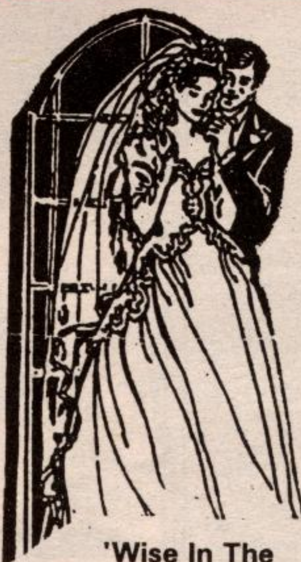
'Wise In The Ways Of Weddings'

Open 7 Days a Week in December until Xmas 164 Wyndham St. N., Downtown Guelph • 767-1317