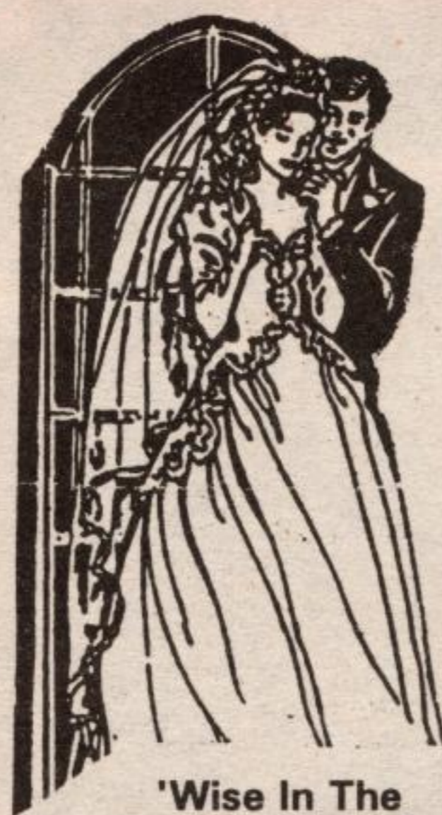
'Wise In The Ways Of Weddings'

Open 7 Days a Week in December until Xmas 164 Wyndham St. N., Downtown Guelph • 767-1317