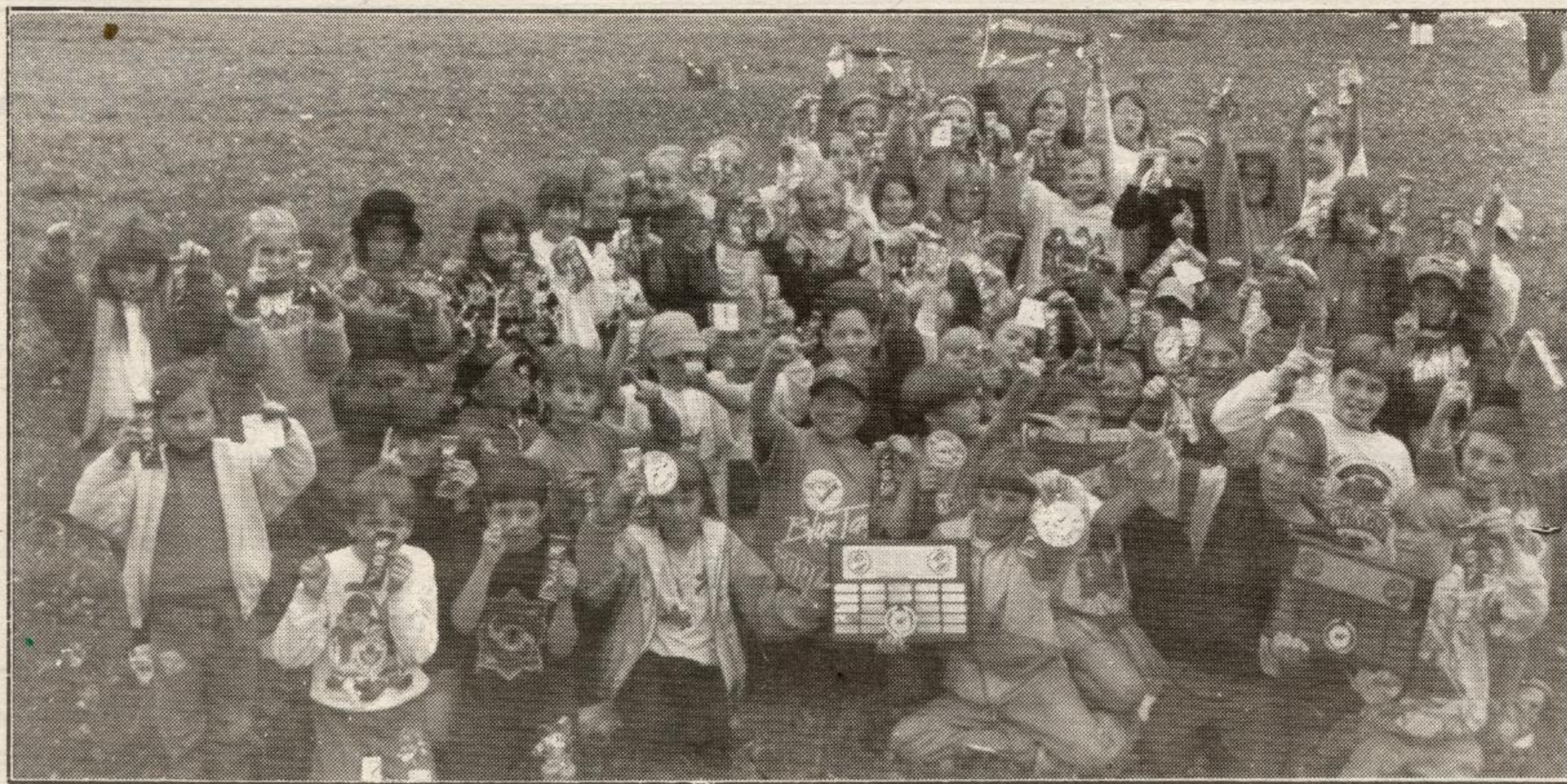
RUNNING STARS! This group of Rockwood Centennial Junior and Primary cross-country runners recently won the Junior overall award at a county meet at the Conservation Area.