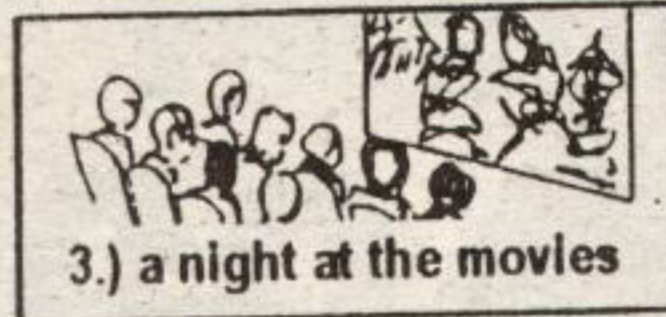
3.) a night at the movies

See what you could have in 35 years for just $25. a week.