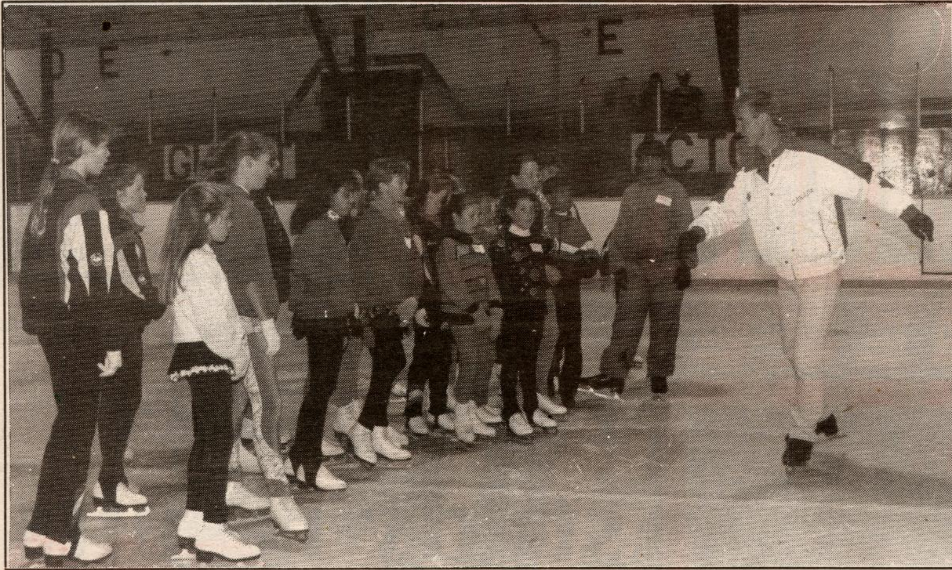
WORLD-CLASS INSTRUCTION! Top figure skater Paul Martini dropped by the arena Thursday to assist 40 Acton Figure Skating Club members with their freestyle skills. Martini and partner Barbara Underhill are World Pairs professional champions.