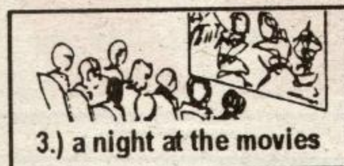
3.) a night at the movies

See what you could have in 35 years for just $25. a week.