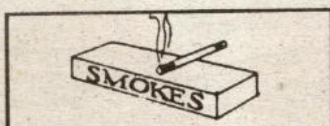
1.) a carton of cigarettes

"Last year, we asked the community to get involved in the process, and that is even more important now. We must talk about possible areas of savings."