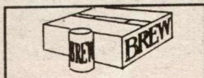
2.) a case of beer