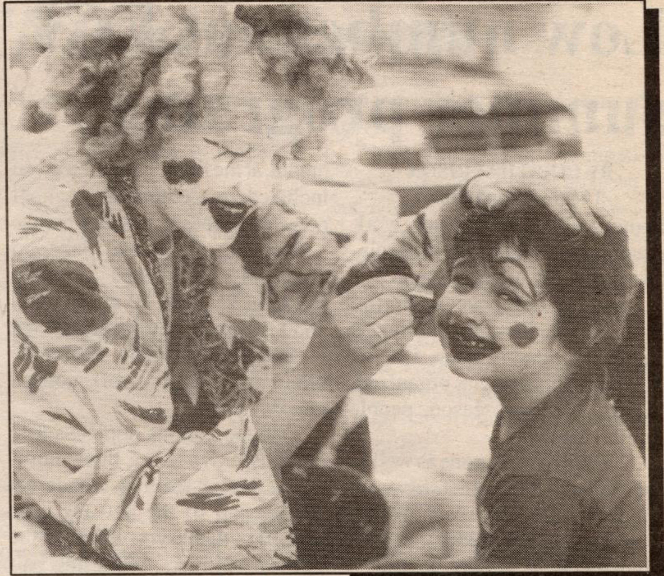
HAPPY FACES! The recent Community Appreciation Day at Rockwood's Cote & Associates drew many local residents. The face-painting exhibit was a favourite with young visitors!