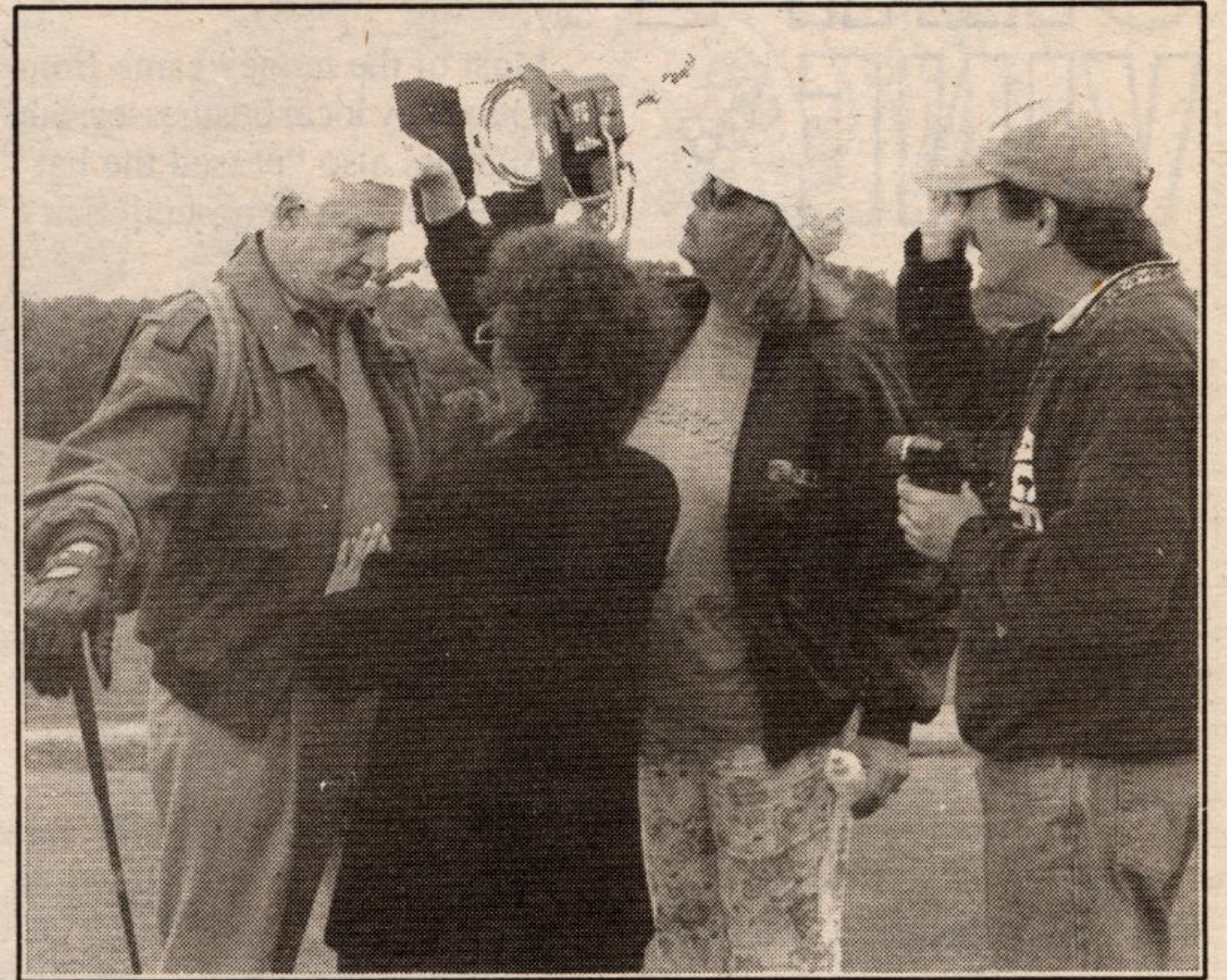
BEHIND-THE-SCENES! Production crew works with Leslie Nielsen to prepare the actor for shooting of his upcoming Hide House commercial. The location was Blue Springs Golf Club's first tee.

to be here on this particular golf course, because it's just so beautiful. Everyone has been so helpful!