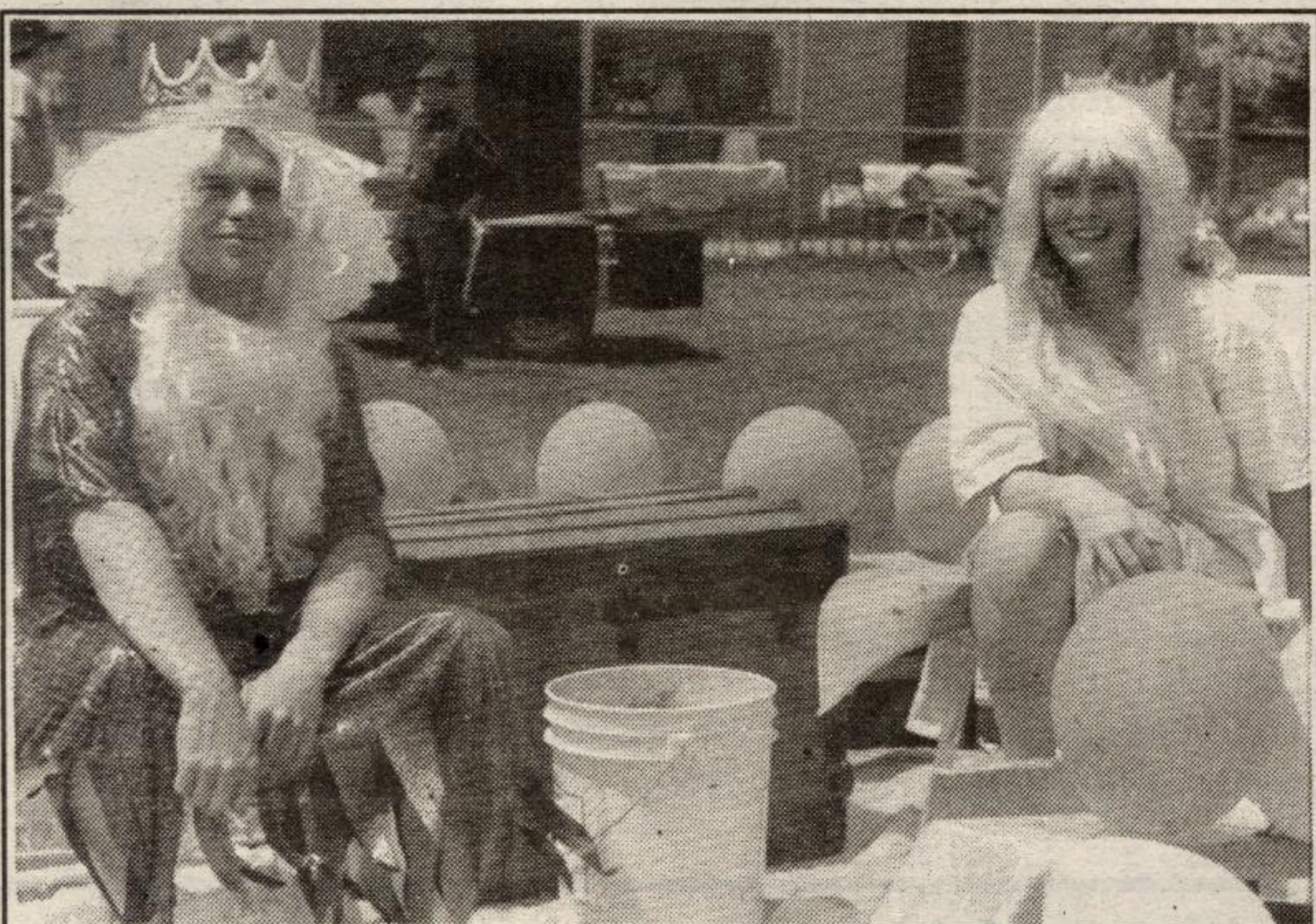
King Neptune and a Mermaid from the deep rode on a float from Ye Olde English Chip Shoppe.