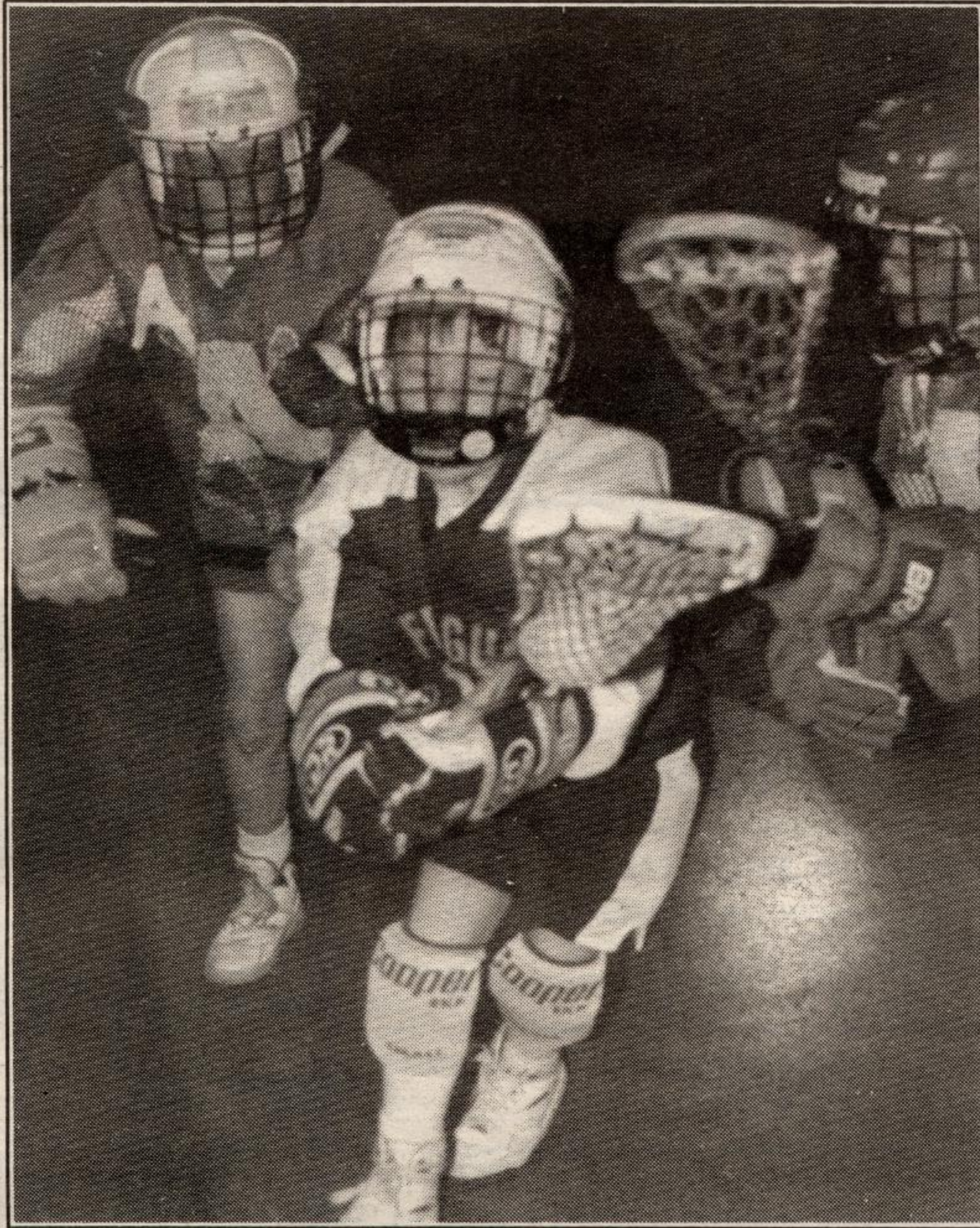
WE'VE GOT YOU! Two Acton Ram Tyke lacrosse players appear to have a Ferguson opponent caught in his end last Wednesday at the Community Centre.