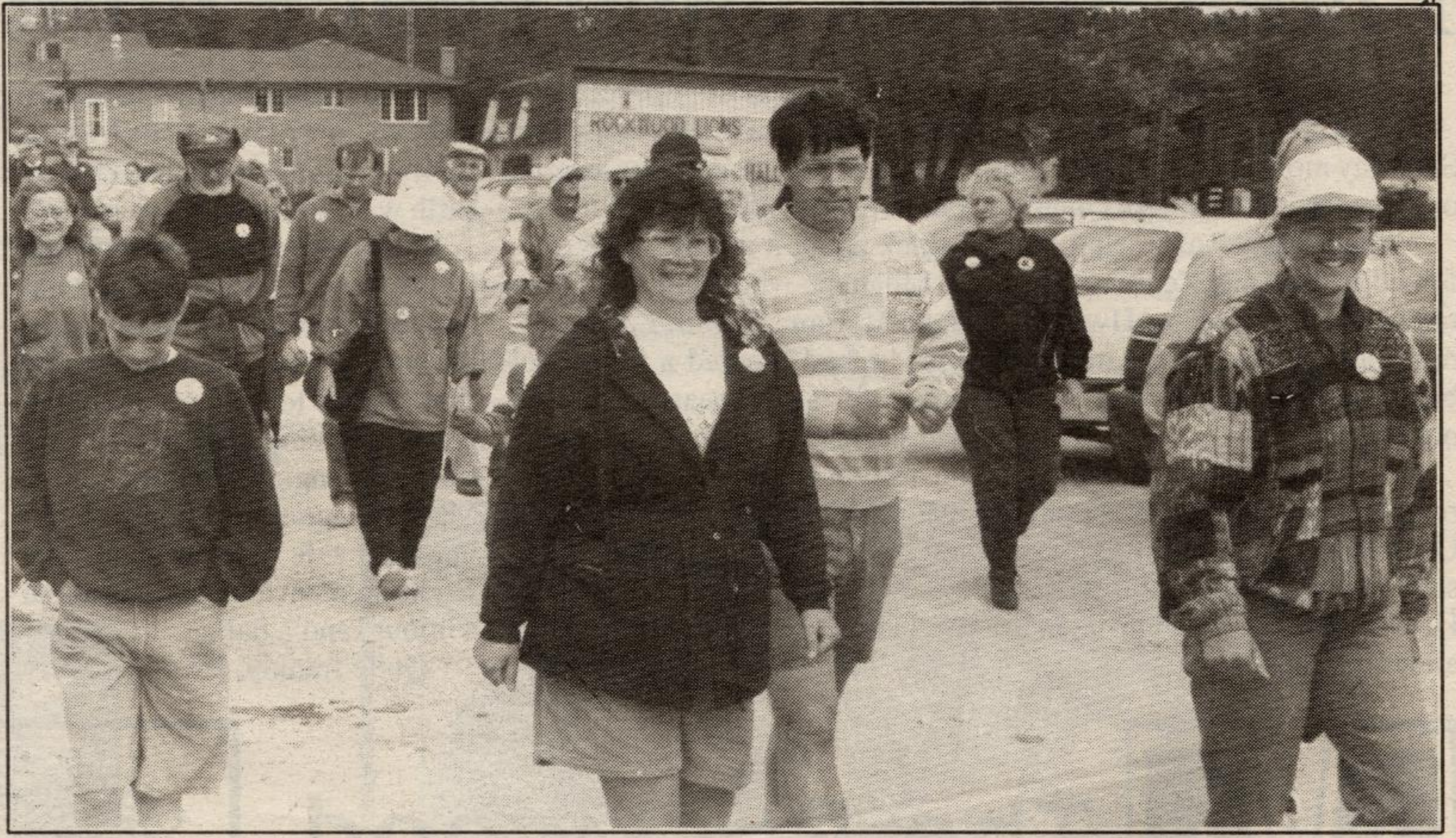
GETTING FIT! Hundreds turned out Saturday morning at the Lions' Waterside Park to participate in Rockwood's first FitWalk to celebrate Canada's Fitweek. People looped through the Conservation Area during their walk, which took about an hour.

"It's good to see everyone out and participating. As long as people come out we'll still do it. Hopefully it will continue to be a yearly event," she says.