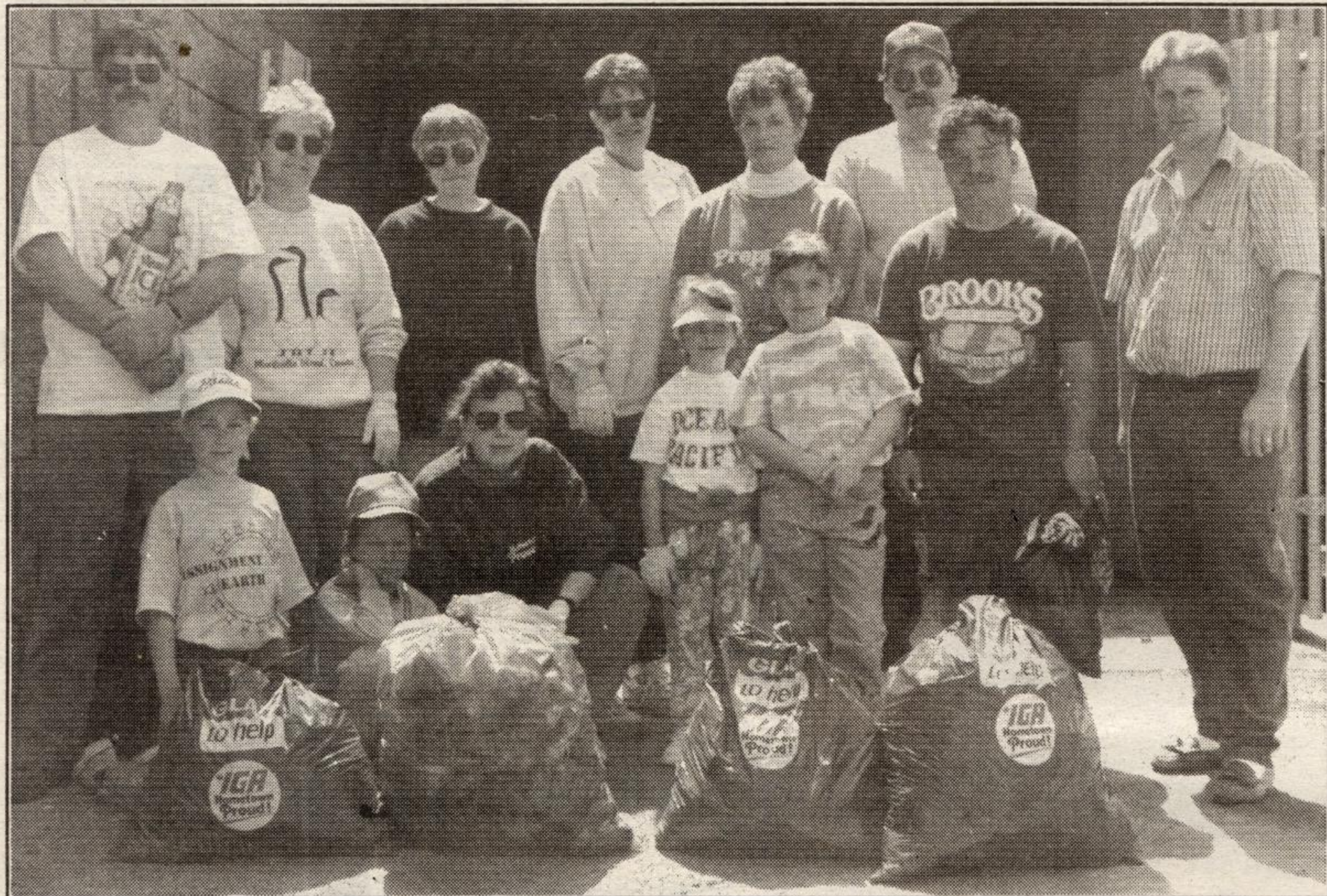
THANKS! These dedicated volunteers participated in The Great IGA Hometown Spring Clean-Up hosted by Acton IGA on Saturday. Participants were given garbage bags and a section of town to clean.