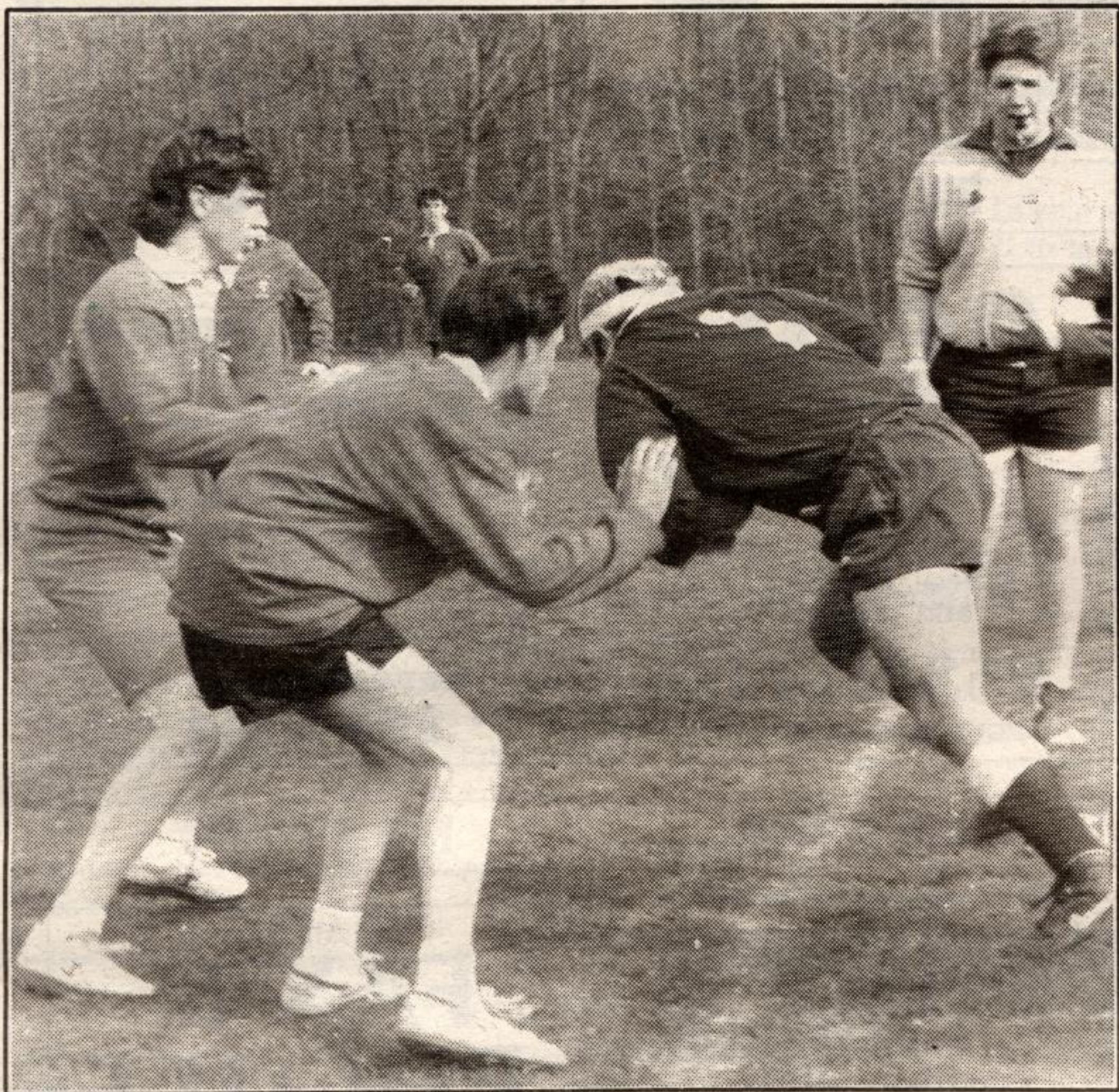
BEAR DOWN: The Acton Redmen Junior Boys' rugby team missed many open field tackles against Milton on Thursday, but appeared to stop an opponent here.

The 0-4 Redmen host Nelson at 4 pm tomorrow (Thursday).