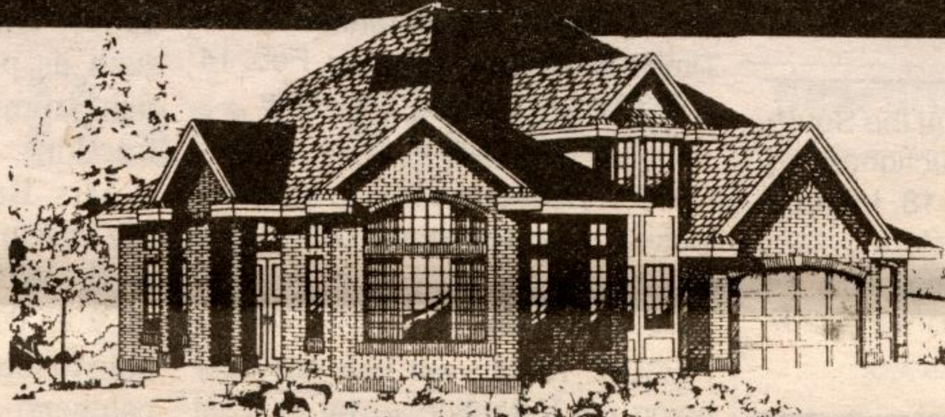
Plan No. U-849 3039 SQ.FT.